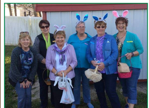
Some of the patrons at the adult Easter egg hunt at the Warren County branch on April 11.