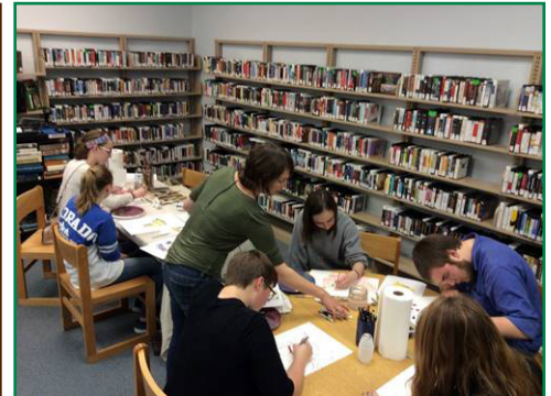
Teens learned about watercolor painting and adding their own touches to anime art at the Hermann T.i.L.T. program on April 12.

Quality public library service is not a partisan issue. Scenic Regional Library encourages its patrons to contact their representatives in Congress as soon as possible and ask that IMLS funding be preserved in the federal budget. Congressional staff members keep track of calls from constituents on both sides of issues and pass the information along to the elected officials.