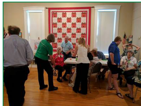
The Friends of the Library in New Haven put on a lovely reception at the Old New Haven School after their ground breaking on April 15.