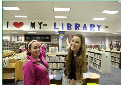
Patrons show their love for the Union branch during National Library Week, April 9-15, 2017.