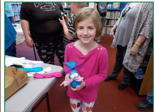
Kids at the Sullivan branch made sock bunnies during Kid's Club on April 17.