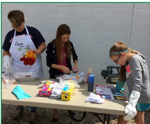
Teens at the Pacific branch created one-of-a-kind garments with colorful tie dye techniques. A participant reads up on the latest methods before she begins.