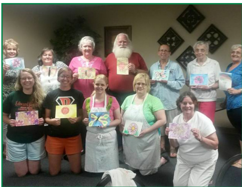
Proud Owensville branch participants showcase their works of art they created during the "Watercolor for Everyone" program.