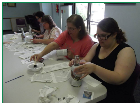
Union branch participants are hard at work transforming old bottles and cans into beautiful new vases. Members used torn pages of old books to create their finished products.