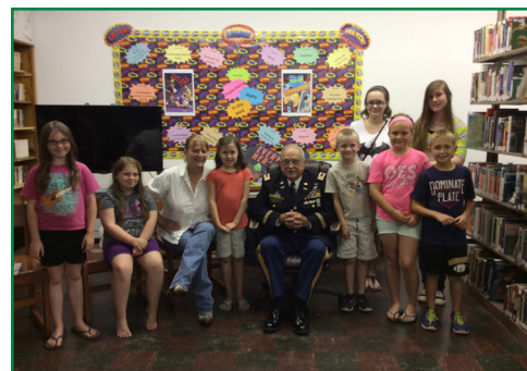
Heroes come in all forms! During Kid's Club at the Owensville branch children pose with two heroes who served in the armed forces. They had great questions and learned a lot.