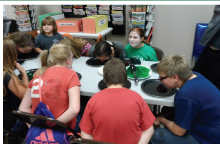
Zombie brain-eating contest at the St. Clair Branch's Teen Time on October 30.

Positive activities like these help our communities provide teens with many of the 40 developmental assets that they need to grow into healthy, caring, and responsible adults ( http://www.search-institute.org/content/40-developmental-assets-adolescents-ages-12-18 ). Visit the Upcoming Events section of the newsletter to see what's going on for teens at your local branch.