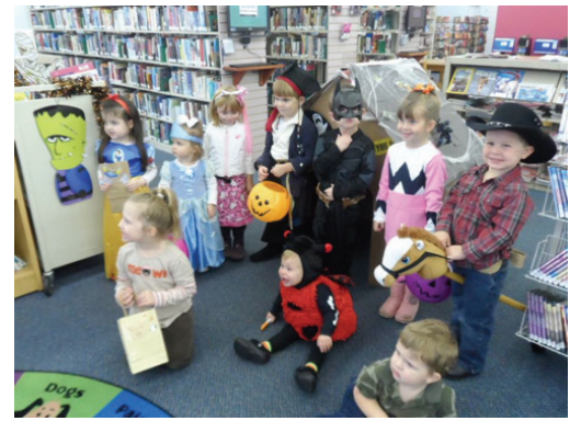
Children attend storytime at the Pacific Branch on Halloween.