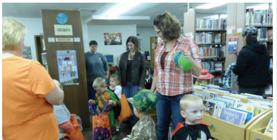
Children stopped by the Owensville Branch to trick or treat on Halloween.