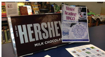
A lucky participant in the Winter Reading Program at each branch will win a drawing for a giant Hershey bar.

Scenic Regional Library's Winter Reading Program for kids and teens continues until March 15. It's not too late to sign up! Visit your local branch to pick up a Winter Reading BINGO card and discover a new genre or two this winter. Each square on the BINGO card represents a different genre or subject of books. If you read 5 books at your reading level (or 4 if you use the free space), you get a BINGO. Bring the