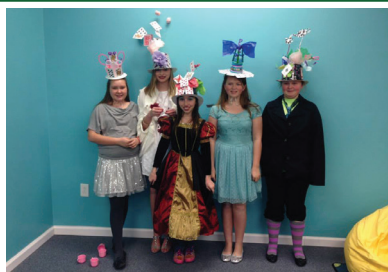
Teens dressed up for the Hermann Branch's Lewis Carroll Un-Birthday Bash on January 17.