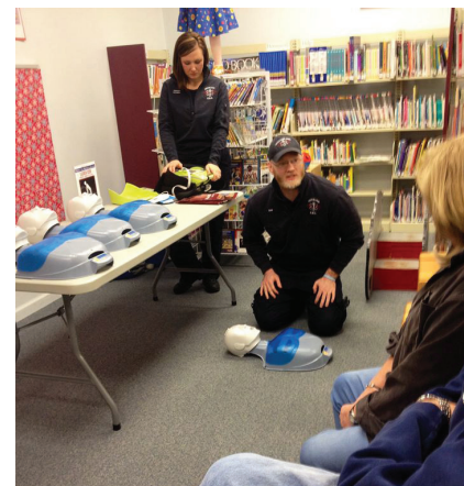
The Hermann Area EMS presented a CPR class on January 22 at the Hermann Branch. They even allowed participants to practice chest compressions on dummies.