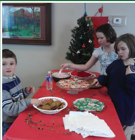
In December, the St. Clair Branch had Cookie Day. The branch celebrated the holidays with cookies, tea, and coffee for patrons throughout the day. They also had a cookie exchange.