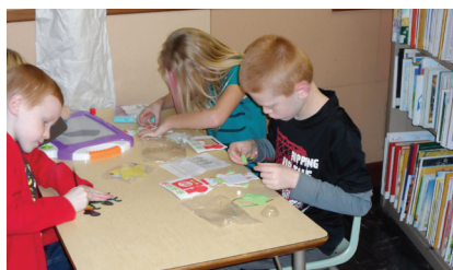
Children made Christmas ornaments at the New Haven Branch in December.