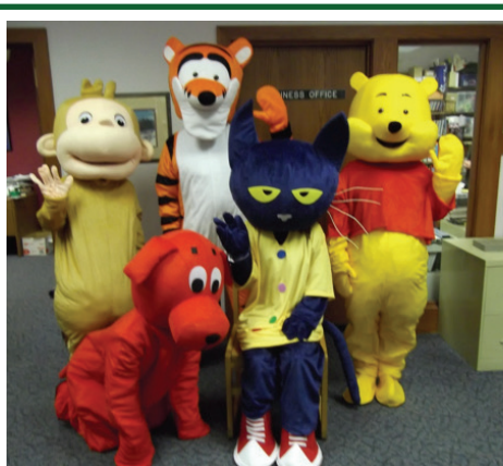
The Library recently purchased six costumes (The Grinch hasn't arrived yet!) for future children's programs and events. Library staff poses in the costumes above—Curious George, Clifford, Tigger, Pete the Cat, and Winnie the Pooh.