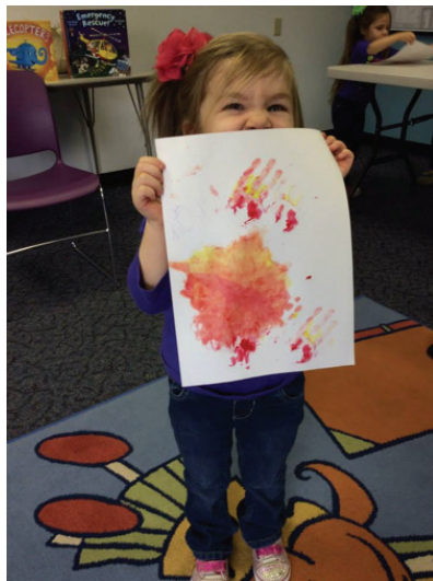
Even the youngest patrons enjoy the stories and crafts at the Union Branch storytime.

Tuesday, February 24 from 6-7 PM Learn how to make simple fabric wreaths that can be tailored to fit any holiday or season. Reserve your spot by calling 636-583-3224. Space is limited.