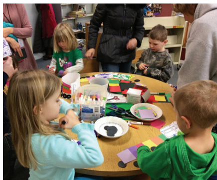
A big crowd gathered for the Transportation story hour at Hermann Branch.

Thinking about Presidents of the USA? Check out the Scenic Regional collection of books for readers of all ages, including books on CD, and downloadable eBooks and eAudiobooks.