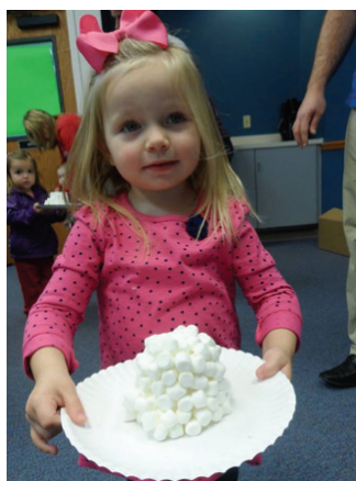
Warrenton storytime had fun making marshmallow igloos.