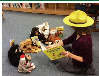
The Scenic Regional in Hermann is prepping for their Curious George visit on February 6 at 10:00am. Join the fun and remember to bring your camera!

We will be discussing Still Alice by Lisa Genova.