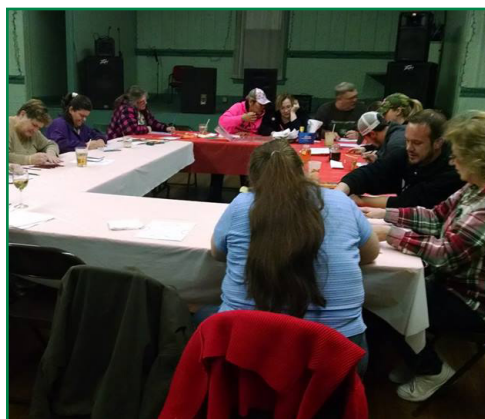
Participants enjoyed the Coloring & Cocktails program and visiting with friends at the Miller House Pub & Grill in Owensville.