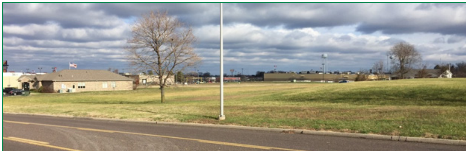
The library is purchasing a lot from the First Presbyterian Church in Sullivan on Cumberland Way for the new branch.

The library has entered into a contract with the First Presbyterian Church to purchase a 1.5 acre lot on Cumberland Way, which will be the site for the library's future Sullivan branch. The Sullivan City Council approved the subdivision of the vacant lot on January 20. The library anticipates that the closing on the property will occur in late-February. The library plans for the new branch to be open by the fall of 2018 and be at least three times the size of the existing facility. The Sullivan Public Library became a branch of Scenic Regional Library on October 1, 2015.