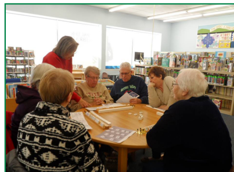
Pacific branch patrons enjoy each other's company while they learn Mahjong. More people are learning the game each week and soon we will begin our competitions!