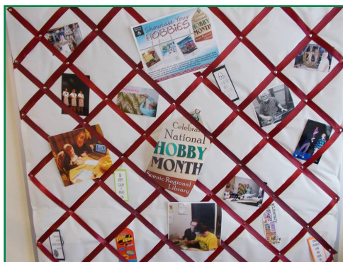
The Sullivan branch displayed several hobbies of individuals on their Hobby Showcase board during National Hobby Month.