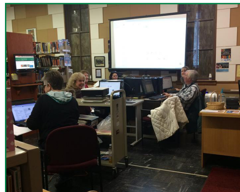
Patrons at the New Haven branch learned how to use Ancestry to research their family history and genealogy.

This family program will feature Irish dance and music, trivia, crafts, storytime, snacks, and more. Plan to get your green on!