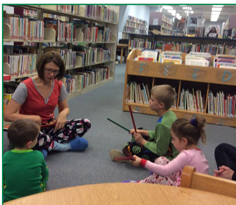
Jammy Time was a lot of fun at the Hermann branch. Children wore their jammies, listened to a story, and played music with rhythm sticks.