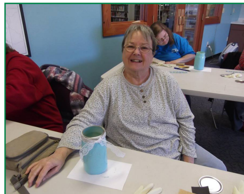
The Union branch crafters learned how to antique Mason jars to be used as utensil holders at the latest Craft That program.