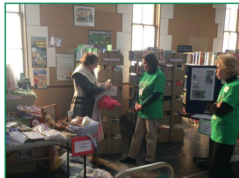
Several hobbyists shared their individual skills at the Mini Hobby Expo held at the New Haven branch.

Call to find out what activities are planned.