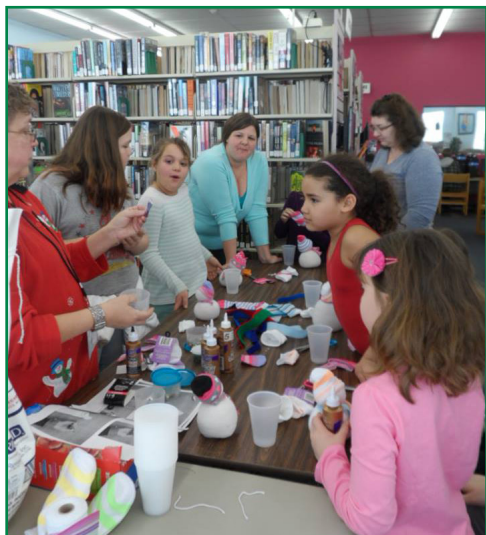
Kids Club enjoyed an afternoon of making snowmen out of socks. The children did a great job decorating them and were able to take their craft home.

Every Tuesday at 10:00 am For preschool-age children.