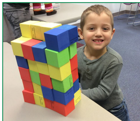
This little patron shows off his creation he built during Storytime at the Warren County branch.