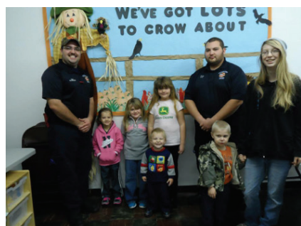
The crew from the Owensville EMS read to children at the Owensville Branch storytime on November 23.