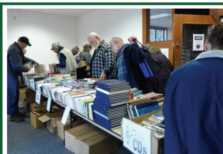
Buyers at the Union Branch were eager to browse the tables on opening day of the Library's Fall Book Sale.

The library will continue to mail paper notices to patrons when an overdue item is being billed to their account. Only about half of the library's users have an email address on their account; patrons who want to continue receiving overdue notices are being encouraged to have a current email address added to their account. Patrons will be able to opt to receive overdue notices by text message beginning in mid-January.