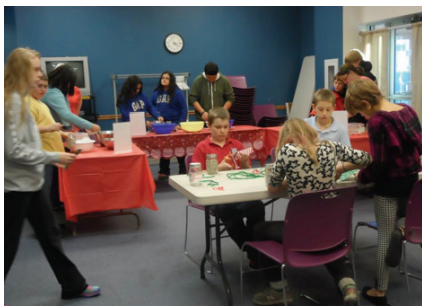
Teens at the Warren County Branch's first Teen Tuesday made "Toffee Coffee in a Jar" on December 10.