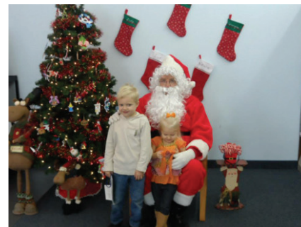
Santa Claus visited children at the Pacific Branch for storytime on December 5.