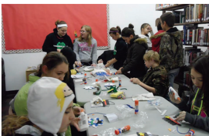
Santa Claus visited children at the Owensville Branch for storytime on December 7.