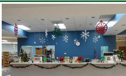
The Warrenton Branch staff did a great job decorating their building for the holidays.

Fortunately, with increased funding from the Library's recent tax increase it will be expanding its outreach services in 2015. The Library has been contacting organizations in its local communities and offering outreach services, but we haven't reached out to everyone. If you work at a service organization and think that your clients or customers would benefit from library services, contact the library at info@scenicregional.org or call 636-583-0652 to see how we can possibly serve your organization.