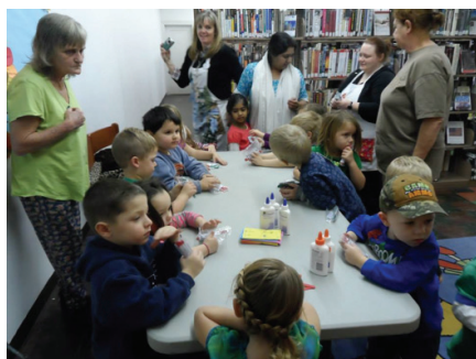
Children from Head Start visited the Owensville Branch for storytime and a craft on December 5.