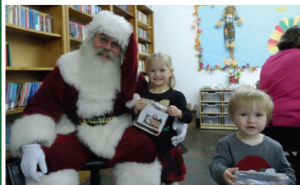
Santa visited the Owensville Branch's ornament-making program.