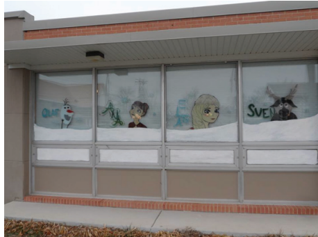
The St. Clair High School Art Club painted the St. Clair Branch's front windows for the St. Clair Holiday Window Painting Contest.