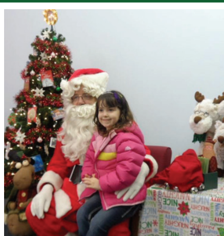
Santa visited the Pacific Branch for their ornament-making program on December 2.