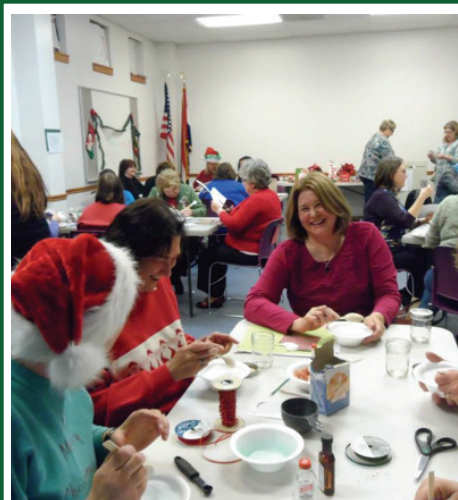
The Warrenton Branch had a packed house for their Christmas Gift and Give program. Participants created new projects at several craft stations. The program included an Ugly Christmas Sweater Contest.