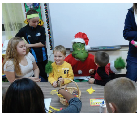
Staff at the New Haven Branch participated in Reading Night at the R-II School on November 25.