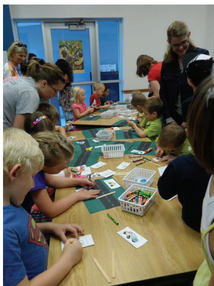
Storytime crafts at the Warren County branch.

Visit scenicregional.org for more information!