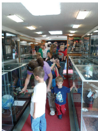
Children visit Southeast Missouri State University's NASA Explorer Bus at the Warren County branch (left) and Owensville branch (above).

Anyone interested in joining the book club or wanting more information can visit www.scenicregional.org/onlinebookclub . A full list of the Modern Library's titles is also available on the webpage.