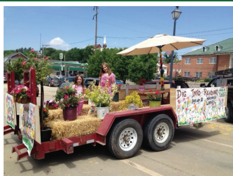
The Hermann branch staff and volunteers built a Maifest Parade float to promote Summer Reading Program.