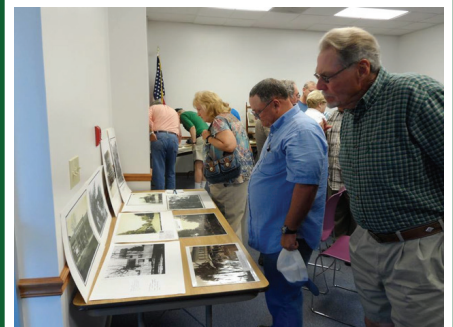
Attendees at the Warren County branch's History Night program on June 11 examine old photographs on display.