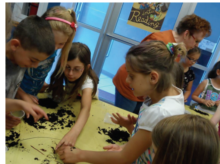
Worm races at the Warren County branch's Kid's Club in June.