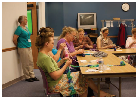
Participants knit scarves at the Warren County branch's Beginners Knitting Class on May 21.