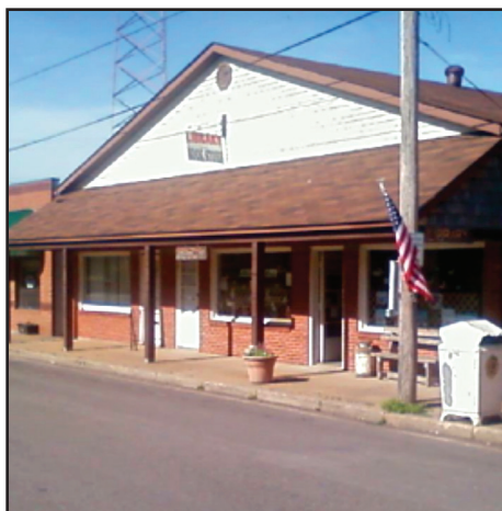
Gerald Area Library Located at 357 South Main Street Gerald, MO 63037

Scenic Regional Library also provides the Gerald Area Library with