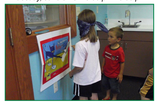
It was all about Pete the Cat today at Storytime! Children play Pin the Shoe on Pete at the Union branch.

FAMILY PROGRAMS Warrenton's Hometown Heroes Tuesday, June 9 from 3:00 pm - 5:00 pm