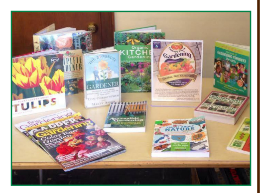
New Haven displays a selection of gardening books offered at the branch as part of the "Square Foot Gardening" program held in May.