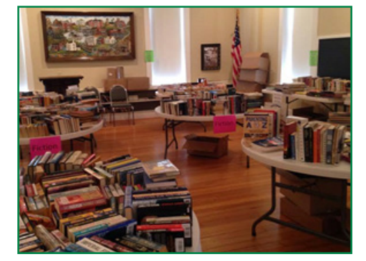
The New Haven branch book sale was held off-site at the Old New Haven School building.

The library would like to thank all the volunteers who helped make the spring book sale a big success!