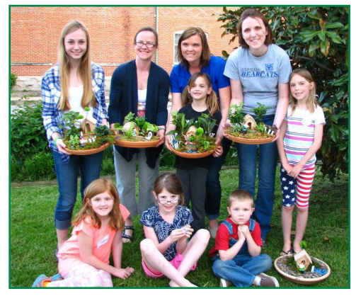
Several patrons practice their green thumbs during "Design & Build Your Own Fairy Garden" presented by the Hermann branch. The class was taught at Hermann Florist.