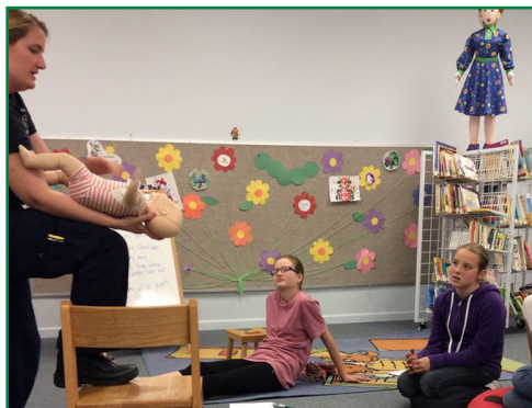
Hermann's newest babysitters are now trained and ready for summer! The "Babysitters' Clinic" program went over the basics every SUPER sitter should know.