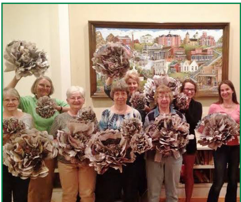
New Haven branch participants learn how to make beautiful newspaper flowers and sparkling mason jar candle holders just in time for Earth Day!