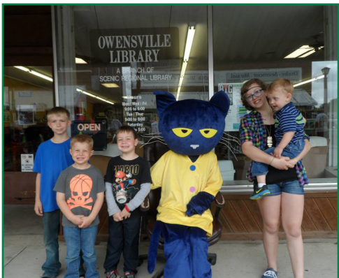
Kids of all ages were happy to see Pete the Cat at the Owensville branch. Pete took pictures, read with children and had a lot of fun!