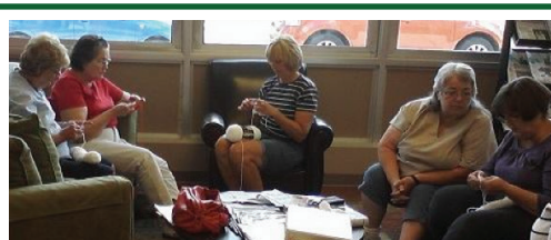
The St. Clair Branch's Sewing Circle meets each Tuesday. Members work on a variety of projects, including crocheting, knitting, embroidery, and quilt blocks.

ST. CLAIR at City Hall #1 Paul Parks Dr.