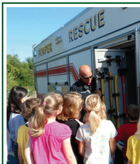
The St. Clair Fire Department visited the St. Clair Branch's Homeschooler's Club on October 3.

While it would be wonderful to provide the public with more new materials, better and bigger facilities, and longer hours, the library simply can't afford it. The schools, ambulance districts, and fire districts in the area have all receive multiple tax increases over the past fifty years. The library is still collecting its original tax rate from 1959—ten cents (per $100 of assessed property value). The average school district's tax rate in Missouri has gone from $2.37 to $4.03 during that same time. We feel that we're providing the public with the best possible services we can with our limited resources.