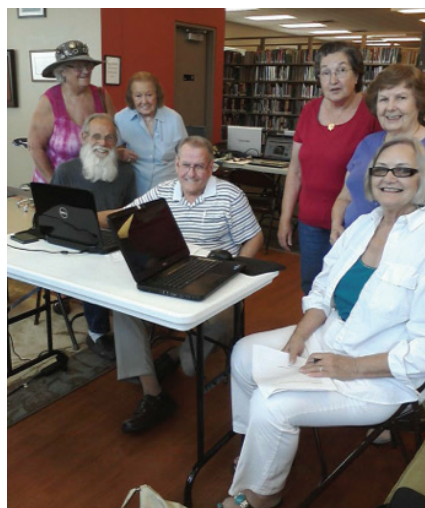
Participants in a basic computer skills class at the St. Clair Branch.