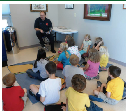
The St. Clair Fire Department visited the St. Clair Branch for preschool storytime on October 3.

November 20 at 2 PM The Book Club will be discussing Safe Haven by Nicholas Sparks. Please join us.