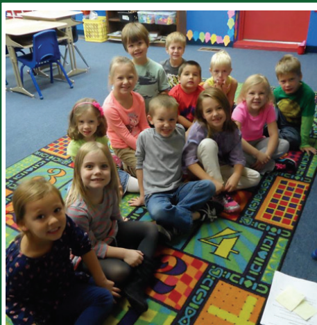
The Warrenton Branch visited Wesleyan Kiddie Kollege to present a storytime on October 7.

November 21 at 7 PM The Agony of Alice by Phyllis Reynolds Naylor will be discussed. The club is free and open to the public.