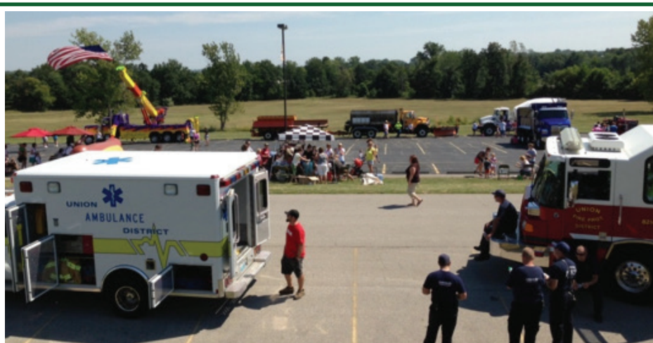
The Union Branch held its first Big Machines event on September 7 at East Central College for Library Card Registration Month.