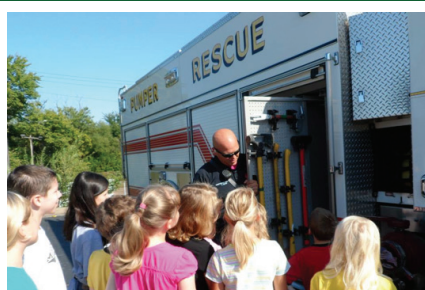
The St. Clair Fire Department visited the St. Clair Branch's Homeschooler's Club on October 3

We will be discussing The Book Thief by Markus Zusak.