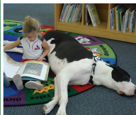
Therapy Dogs, Inc. presented their popular Storytime with Max program on October 12 at the Pacific Branch.