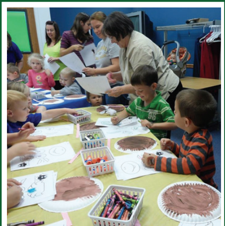
The Warren County Branch made cow faces for their storytime craft on October 1st.