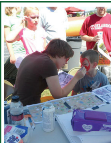
Students from East Central College volunteered to provide free face painting at the Union Branch's Big Machines program.