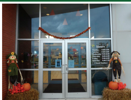
The Warren County Branch is ready for autumn!