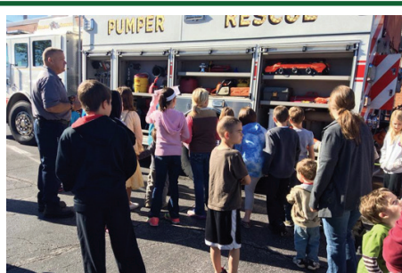
Firefighters with the St. Clair Fire Department were special guests at the St. Clair Branch storytime on October 17. Children were able to climb on board a fire truck after storytime.

The Unlikely Pilgrimage of Harold Fry by Rachel Joyce.