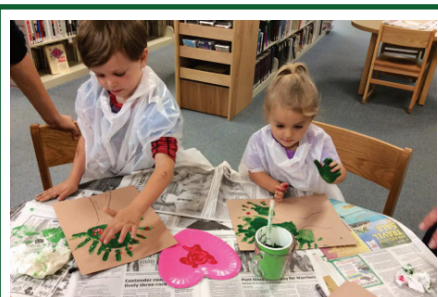
On October 9, children at the Hermann Branch's storytime made apple artwork.