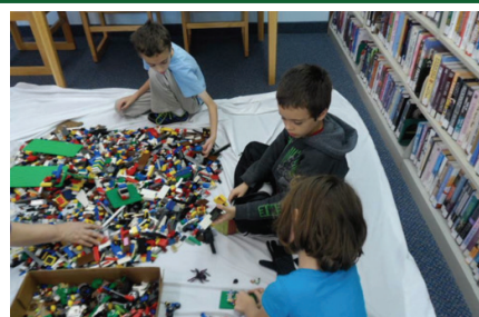
On October 18, the Pacific Branch's Read 'N Build club built homes fit for their eight-legged pets for Halloween.