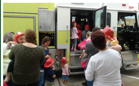
On October 9, the Pacific Branch had a special Fire Prevention Story Time with the Pacific Fire Department as special guests. In addition to stories, the firemen showed the kids their special gear and gave a tour of their fire truck.