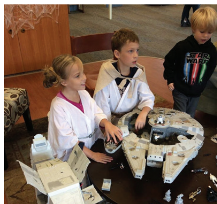
Participants take part in activities at the St. Clair Branch for Star Wars Reads Day on October 11.

Drop in and play games or learn Chicken Foot, a popular domino game that is fun for all ages.