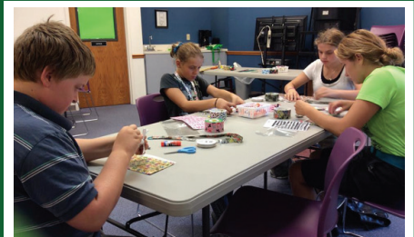
At the Warrenton Branch's Teen Tuesday on September 16, kids shared unique back-to-school items from Pinterest and made pencil bags, lanyards and covered composition books.

In September 2014, all three county library boards voted unanimously to consolidate. The next step will be for the Library to approach the county commissions. Under the law, consolidation requires approval by the county commissions. If they approve the measure, the three county libraries will be a single district.