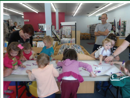
On September 11 at the Pacific Branch, children read "Harold and the Purple Crayon" and colored their own poster.