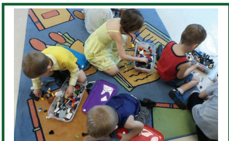
On August 30, the St. Clair Branch's Read-Build-Play Club built buses.

The Scenic Regional Library Foundation was formed in August 2013 to serve as a support organization for the Library. After a lengthy application process, the IRS awarded the organization 501(c)3 tax exempt status on August 27, 2014. The status allows individuals and companies to receive a maximum tax deduction when making a donation to the foundation. In addition to receiving 501(c)3 status, the foundation's main goal over the past year has been to establish and oversee Friends of the Library groups in each of Scenic Regional Library's seven communities. So far, the Friends groups have over 60 Friends members throughout the three-county area. All funds received by the foundation and Friends groups are used to support the Library.