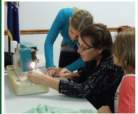
On September 19, the "It's A Stitch" sewing club met at the Warrenton Branch to work on their projects.

Are you cleaning out your basement or garage and have boxes of old books? Did you just finish reading a bestseller and place it on your shelves to collect dust? Donate them to the Library! We add the items in good condition to the Library's collection and sell the others at the Library's book sales. This year alone the Library has added over 1,500 "like-new" donated items to its collection. It's a great way to help the Library and free up some space at home.