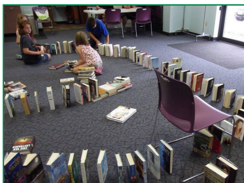
A group of teens work together to make a domino effect out of books at the Union branch. It took a lot of teamwork and creativity!