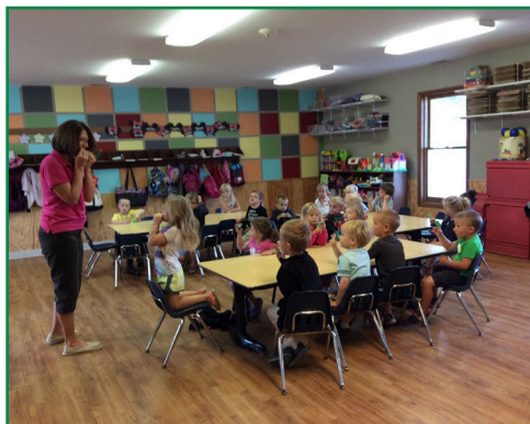
Little Bearcats Preschool enjoys storytime with one of our Hermann branch employees. During Storytime we read books, sing songs, tell rhymes, and have fun!