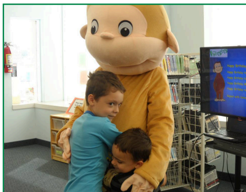
Curious George came to the Pacific branch during Saturday Storytime and entertained the children. They all had a great time making masks and coloring bookmarks.