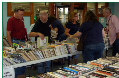
The first book sale shoppers for the Fall Book Sale at the Union branch were waiting for the doors to open at 9 a.m. on September 24!