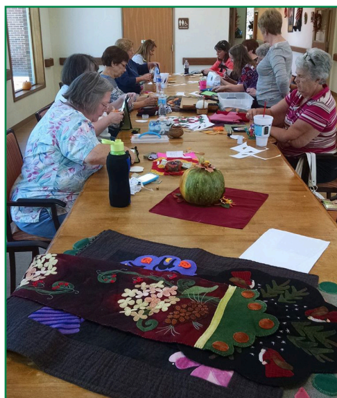
The Owensville branch presented a program teaching Penny Rug techniques at Gasconade Manor. Samples of finished pieces are on the table in the foreground.