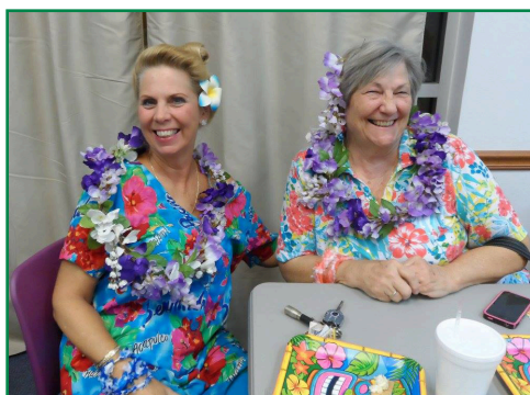
These lovely ladies had a great time "traveling" to Hawaii! Warren County branch watched the movie "Aloha", and had pina colada dip and blue lagoon drinks!