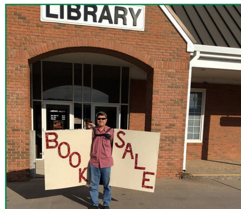
The Hermann branch of Scenic Regional Library had wonderful volunteers help out for the Fall Book Sale! The branch had record-breaking sales and was a huge success.