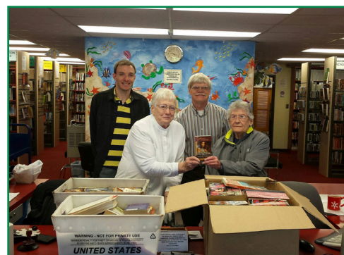
Two ladies from Dunsford Court visited the Sullivan branch and brought some donated books. Here they showcase the new books added to the collection.