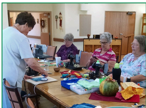
Owensville patrons visited Gasconade Manor to learn how to sew the perfect curved seam during the "Sooo, You Want to Sew?!" program.