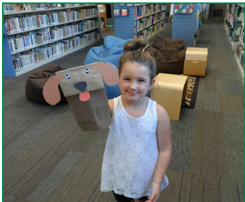
The St. Clair branch has started reading Missouri Building Block Picture Book Nominees. After we read all ten nominees children will vote for their favorite. Recently we read a book about dogs and made dog puppets.