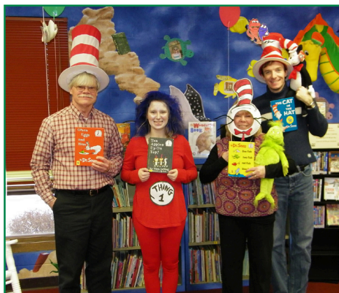
Sullivan branch employees don their best Cat in the Hat gear! Sullivan Public Library became the 8th branch of Scenic Regional Library as of October 1st.

A monthly publication from your local library!