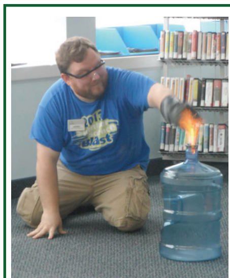
The St. Louis Science Center visited the Pacific Branch on July 24 and ended their program with a bang!

The Hitchhiker's Guide to the Galaxy by Douglas Adams.