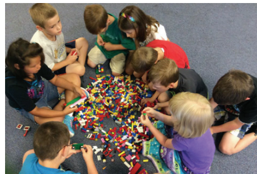
Children build and play with LEGOs at the Warrenton Branch's "Read, Build, Play" program on July 29.

Research has shown that blocks are the best toy for fostering brain development. When children play with blocks without patterns or instructions it encourages imagination. If parents talk to their children about what they are building it develops language skills, such as storytelling. In addition, when older children build with patterns and instructions it supports reading comprehension.