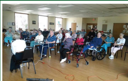
The "Junque in a Trunque" team from the Gasconade County Historical Society presented a program about one-room schools at Gasconade Manor on August 14.

Stop by and make a fall tree craft with your kids!