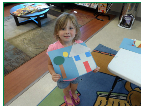
A child displays her picture she made during the St. Clair branch storytime, which focused on different shapes.