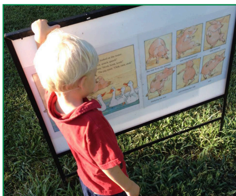
A young patron enjoys the newest storywalk, "Pig in the Pond", in New Haven. The stories at each of our storywalks are changed out every couple of months, allowing patrons to visit often.