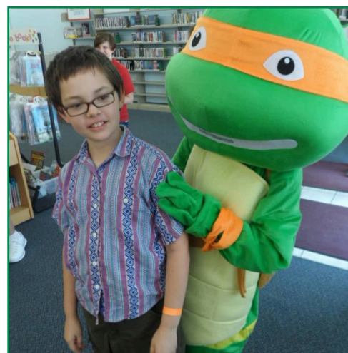
Michelangelo greets a patron at the Pacific branch during the Teenage Mutant Ninja Turtle Meet & Greet. Children had the chance to do crafts, eat pizza and take pictures with the ninja superhero.