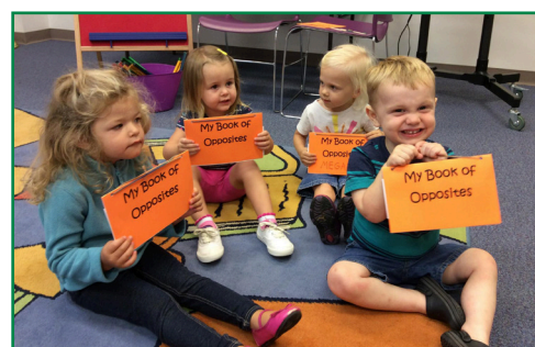
These young patrons show off their craft they made during storytime at the Warren County branch. Children read books about opposites and then made their own book to take home.