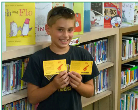
One of our Summer Reading Program winners at the New Haven branch won Cardinal baseball tickets! Individuals who completed the program were entered in a drawing for a number of prizes.