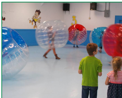
Bubble Soccer came to all eight of our Scenic Regional Library branches as part of the 2016 Summer Reading Program. Patrons had the opportunity to compete as human soccer balls!