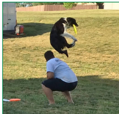
What a tail waggin' good time we had when the St. Louis Disc Dogs visited the Warren County branch! The dogs strutted their stuff as they flew high into the sky!