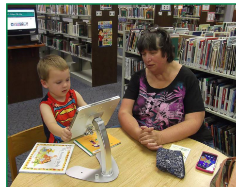
The iPad in our Union branch children's section introduces children to learning games and helps them sharpen the computer skills so necessary in the 21st century.