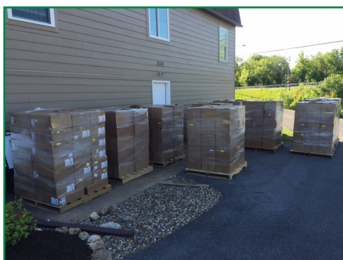
Twelve pallets of books, shown outside the library's administrative offices waiting for pick-up, were shipped to ThriftBooks in St. Louis after the library's spring book sale.

The library's contract with ThriftBooks will not replace its spring and fall book sales. Instead, it will help clear storage space for the next sale.