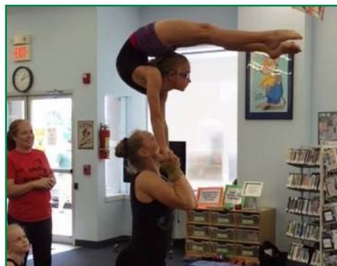
Members of the Acro Gym volunteered their time to come to the Pacific branch and perform some gymnastic moves for the children!