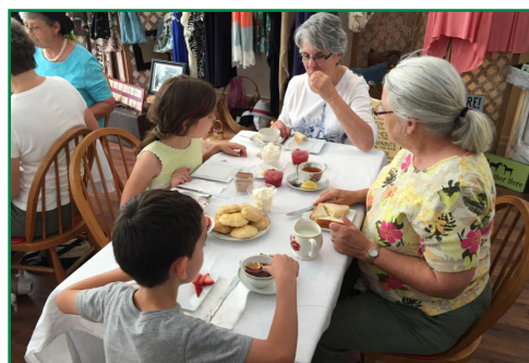
The New Haven branch hosted a traditional English Cream Tea at New Day Mercantile, Front Street, New Haven. They had a great turnout!