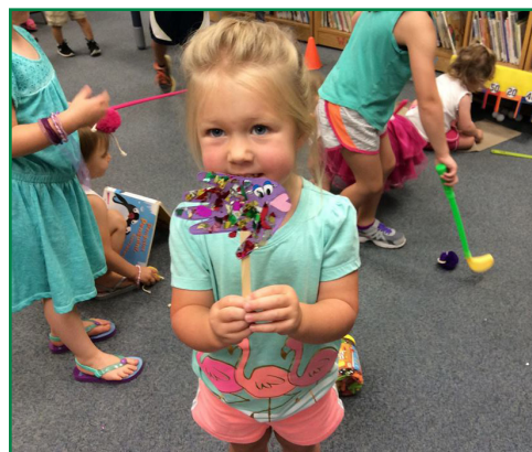
A young Hermann patron proudly shows off her fish she made after storytime. The theme was the letter F: fish, family, friends, fingers, and FUN!