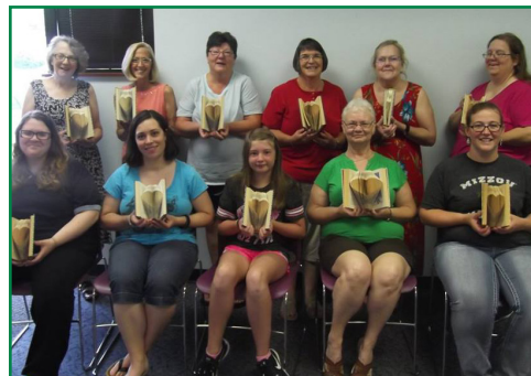
Several ladies at the Union branch had a wonderful time at Craft That turning old books into beautiful new works of art.

Saturday, July 9 See you there. Held at the American Legion grounds in New Haven.