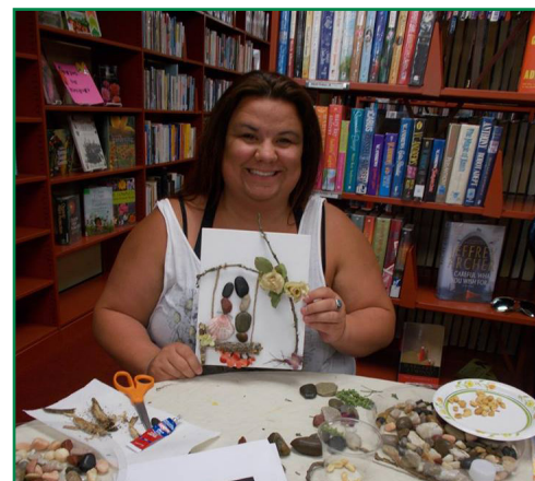
The Sullivan branch enjoyed creating pictures with pebbles, paints, twigs, and pine cones. Some pretty amazing pictures were created that patrons were able to take home.