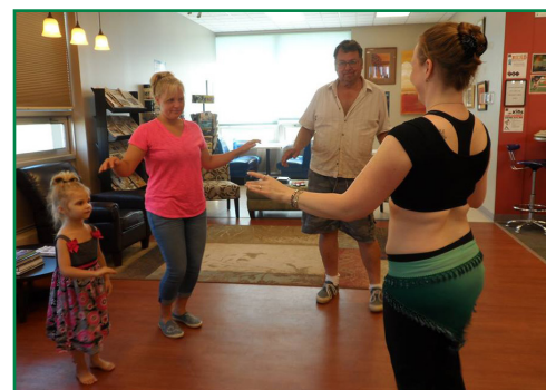
St. Clair patrons of all ages came to the branch to learn the art of Basic Belly Dancing with instructor Nissa.