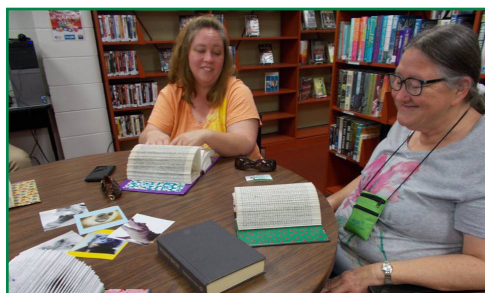
Guests from Dunsford Court and Victorian Place visited the Sullivan branch and made a DIY Organizer with duct tape and recycled books.

Read, Build, & Play Saturday, August 13 at 11:00 am