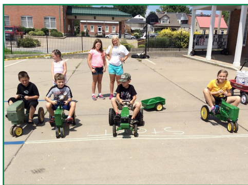
Future farmers braved the hot weather during a peddle tractor race at the Hermann branch. This was one of many exercise-oriented programs Scenic Regional Library presented during the Summer Reading Program.

Storytime Every Tuesday at 10:00 am For preschool-age children. Join us for songs, rhymes, stories, crafts, and fun!