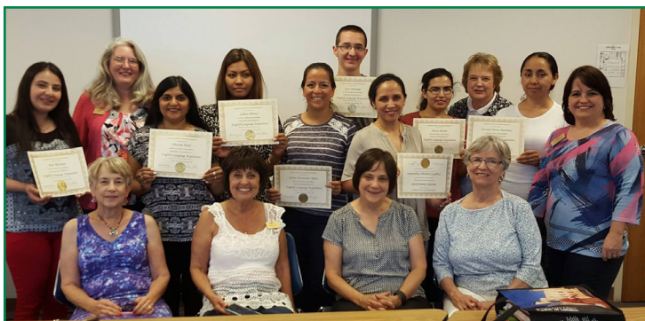
EAL students with their instructors, classroom volunteers, and the AEL staff.