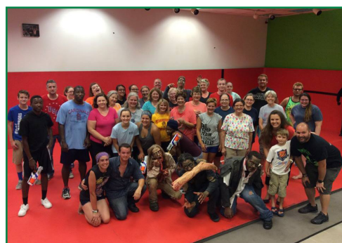
A huge thank you to Hapkido Plus and Phobius Haunted House for helping deliver such a great program: Zombie Self-Defense. Warren County patrons had a great time running from the undead!