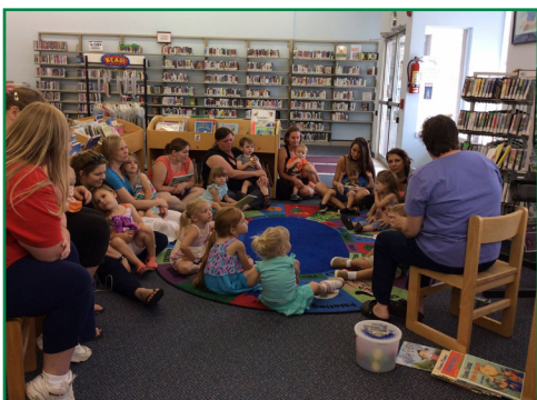
Pacific patrons sit and listen to a storytime about bullies. Afterward, everyone made superhero capes and tested them out!