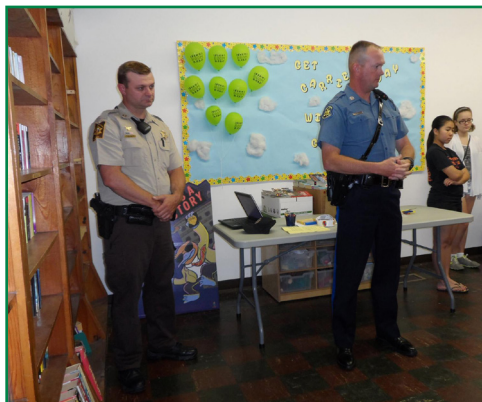
Owensville had some heroes at their branch during the first week of Summer Reading Program Kid's Club! The Missouri State Highway Patrol and Gasconade County Department visited and talked to the young patrons.