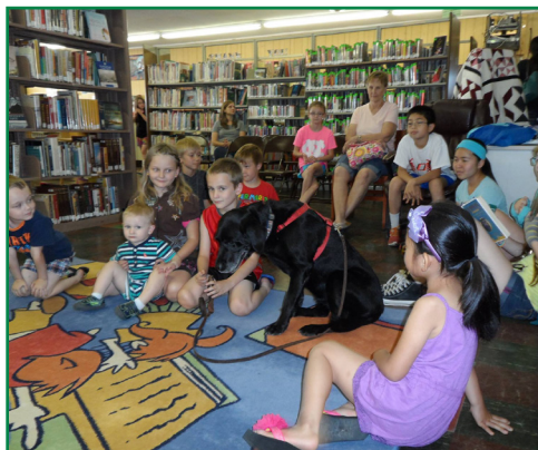
Longmeadow Rescue Ranch brought a duck and a dog to the Owensville branch to teach children that heroes come in all forms!