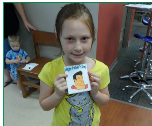
"Dad is my Hero" was the theme for St. Clair branches' storytime in honor of Father's Day. A young patron shows off a card she planned on giving to her dad that she made.