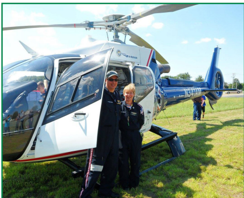
Warrenton's first responders came to the branch and had a great afternoon with the help of the community! It was a huge success with over 150 patrons turning out to meet and greet our local heroes!