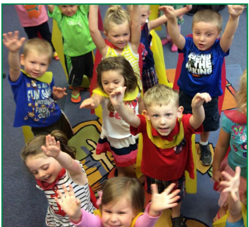
Warren County branch had fun with some superheroes during storytime. Here some of our young readers try out their flying skills.