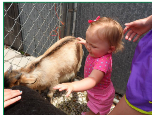
The Pacific branch hosted a Petting Zoo with Pleasure Lane Farms. Children enjoyed playing and asking questions about the animals.