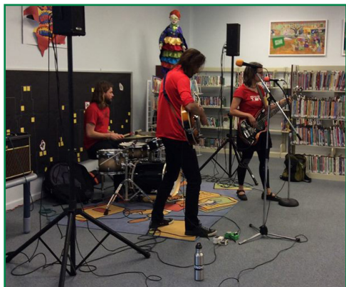
Fire Dog performed at the Hermann branch for patrons. Everyone danced and had a great time listening to some fun music.