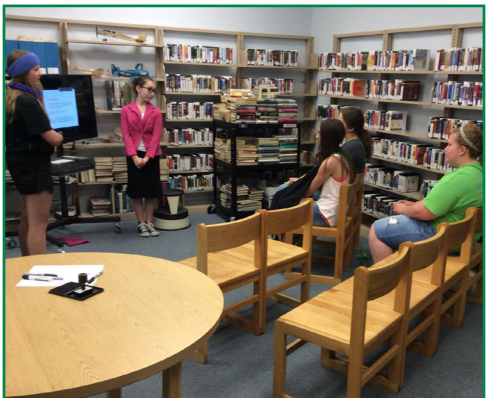
Project T.I.L.T. (Teens In the Library Team) met for the first time at the Hermann branch. Teens discussed future topics they would like to work on for their club.