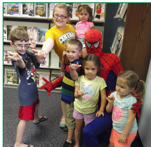
Kids at the Union branch test out their "spidy powers" with the hero himself! Spider-Man came to several branches and hunted for villains and read with the children.