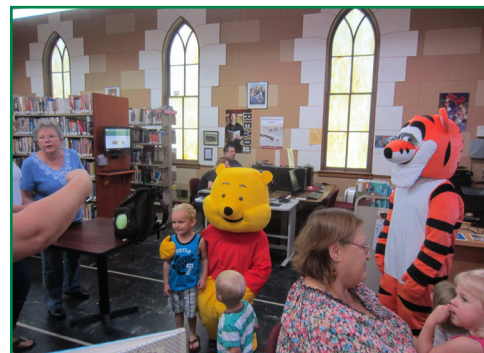
Everyone was excited when Pooh and Tigger visited the New Haven branch! They took time to pose for pictures with everyone that attended.

Featuring live birds. Registration required.