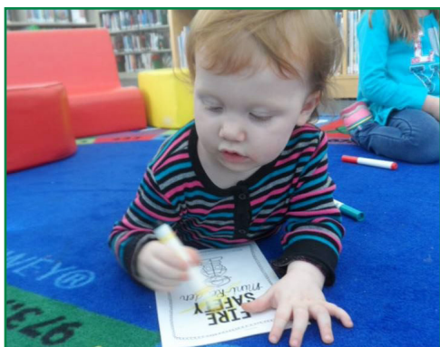
The Pacific branch Kid's Club learned all about fire safety during Fire Prevention Week! Local fire fighters came to the branch and talked to the patrons, showed them their gear they wear to fight fires, and gave tours of a fire engine.