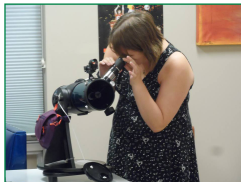
(Above) Patrons at Sullivan and St. Clair using the telescopes available for checkout. Sign up for one today!