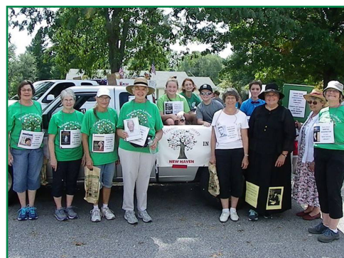
The Friends of the Library - New Haven branch participated in the Balloon Launch Parade in New Haven. Each member wore a banner to promote reading and learning about a historic figure or author.