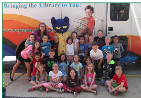
Pete the Cat made a trip to Clearview Elementary in our Bookmobile to visit our Summer Reading Program winner! We had a groovy time and sang songs about Pete.

A monthly publication from your local library!