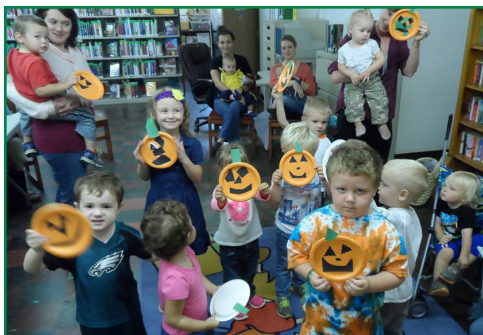
Owensville branch's Halloween themed storytime was a lot of fun! Children played "Pass the Pumpkin" and made a craft to take home.

Tuesday, November 22 at 3:30 pm Peanut Butter Month! We'll make snacks for the critters and us - with Peanut Butter!