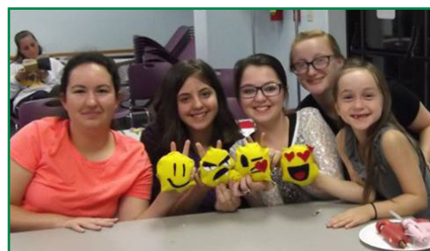
Several patrons display their emoji plushies they created at the Union branch. The teens had a great time putting together their own original emoji. There were lots of laughs and crafting skills tested at this fun event!