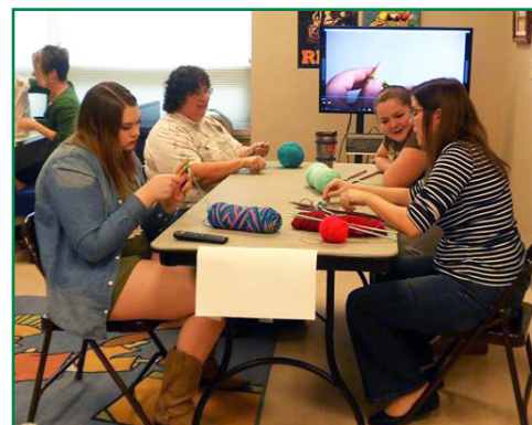
During St. Clair's "Knitting 101" individuals were taught how to cast on, the knit stitch, and cast off. All of the ladies did a great job!