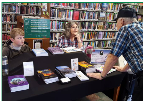
Several authors visited the Owensville branch and spoke about their books and offered them for purchase and signing.