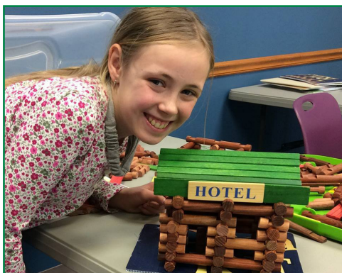
Warren County "Read, Build, & Play" featured Lincoln Logs and Legos. This proud, young patron poses with her building she created during the program.