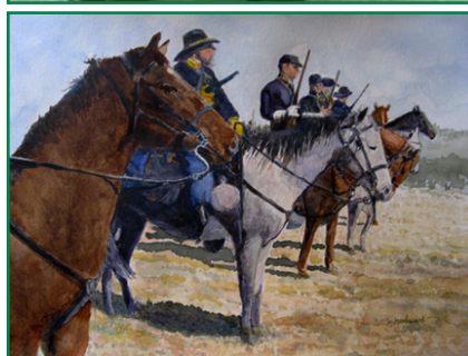
(above) "U.S. Cavalry on the Field"— Battle of Honey Springs, Oklahoma.