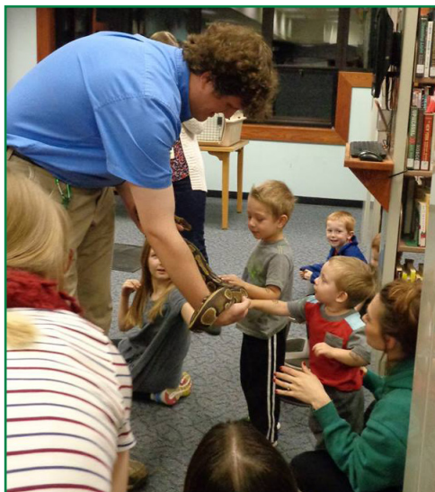
Children at the Union branch had so much fun getting up close and personal with the critters from the World Bird Sanctuary! "Critters for Kids" was presented at every branch in February.

In 2017, six new public libraries will join the Missouri Evergreen consortium. As a result, Scenic Regional patrons will have access to these libraries' collections. The libraries include Festus Public Library, Trails Regional Library (Warrensburg), Jefferson County Library, Douglas County Library, Livingston County Library (Chillicothe), and Texas County Library. Trails Regional and Jefferson County are comparable to Scenic Regional, in terms of collection size. The new libraries will increase the membership to 35. Currently, the Missouri Evergreen consortium has the third-largest collection and third-largest interlibrary loan traffic in the state, after only Mid-Continent Public Library in the Kansas City area and St. Louis County Library. The consortium expects commitments from additional new members in the coming months.