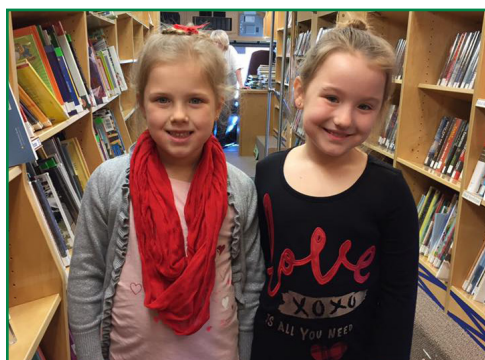
Two friends show off their Valentine's Day attire while they visit to check out books on the Bookmobile.