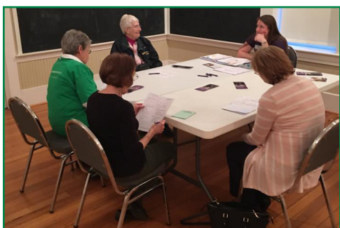
The New Haven branch hosted a workshop on Alzheimer's disease. Participants learned the benefits of early detection and what resources are available to help cope.