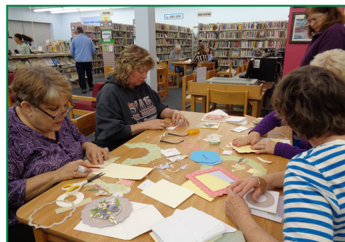
Pacific Patrons left the card making class with several vintage pop-up cards to give to loved ones.