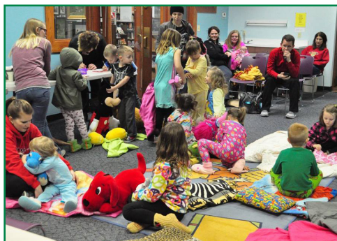
Young Union patrons came to the branch for "Family Fort Night and Stuffed Animal Sleepover" to hear stories, build forts, and have fun!