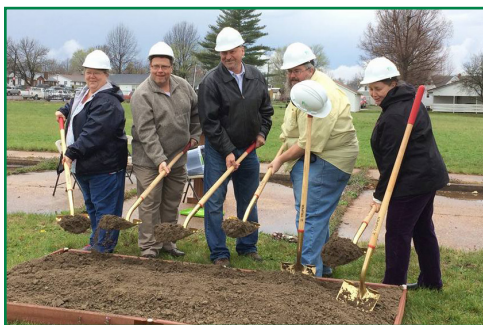
The Owensville Branch Ground Breaking ceremony was wonderful! Scenic Regional Library employees and speakers pose for pictures at the site of the new branch.