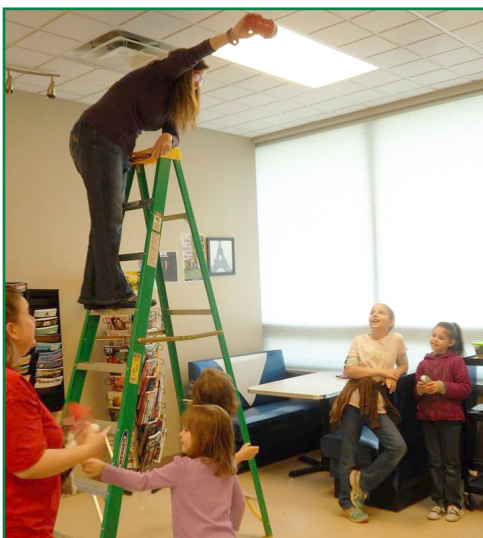
St. Clair Homeschool Group participated in an egg drop contest to learn about engineering. We will resume Homeschool Group again in September.