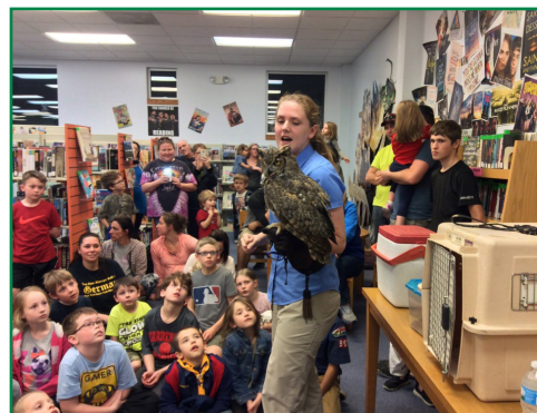
A representative from the World Bird Sanctuary shows attendees an owl at the Warren County branch.