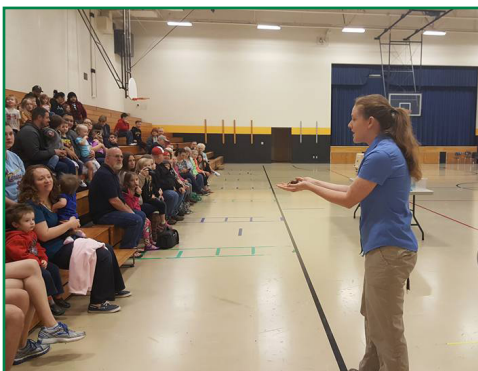
A representative from the World Bird Sanctuary shows attendees a tarantula at the Sullivan branch's Critters for Kids program.