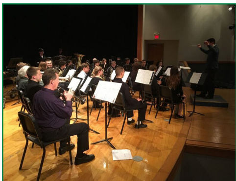
The St. Louis Symphony performs at the Hermann High School Auditorium.

The Warrenton branch presented Critters for Kids on February 23 at the library to more than 250 attendees. A representative from the Sanctuary brought an armadillo, tarantula, boa constrictor, and an owl to each program. In addition to talking about the animals, those in attendance were actually able to touch the creatures.