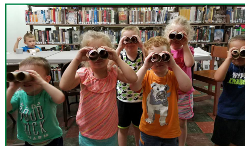
SCENIC REGIONAL LIBRARY

Selfie Scavenger Hunt (Teen Event) Saturday, July 22 at 2:00 pm