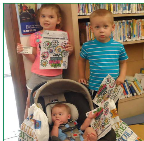
These 3 busy bees have completed their Summer Reading Program challenge with the New Haven branch!! In addition to reading some amazing books from the branch, they each received a prize book, a free ticket to the Magic House, and an entry into the drawing for an even bigger prize!