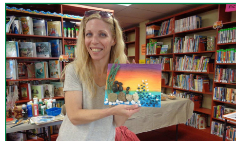
Sullivan patrons used everyday materials during their craft program titled "Pebbles, Paints, & Twigs, Oh My" to create an original piece of artwork they were able to take home!

Friday, July 28 at 1:00 pm Join us for this unique magic show held at the Old New Haven School. Amidst the fun of magic, comedy, and puppetry, we will learn about eclipses and what to expect of the total solar eclipse on August 21st.