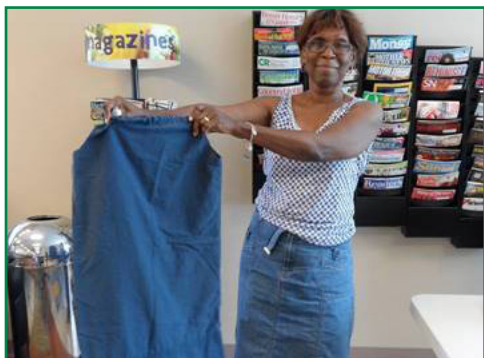
Patrons made Little Dresses for Africa on July 8 at the St. Clair branch.