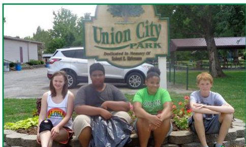
Teens from the Union branch helped make their community a little cleaner during the Pride in Your Park program on July 6.