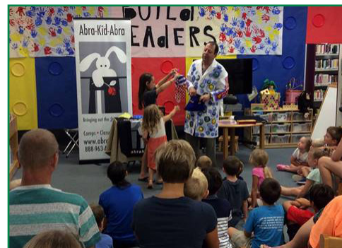
Kids at the Hermann branch learn about the eclipse during Abra-Kid-Abra Magic of the Eclipse on July 24.