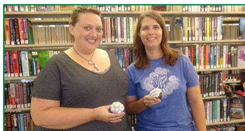
Patrons showed off the cupcakes they made with Russian piping tips at the Pacific branch on July 13.

Thursday, August 24 at 6:00 pm Snacks will be served. Fun for the whole family!