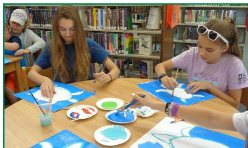
Kids learned to paint turtles on canvas at Kids Club at the Pacific branch on July 1.