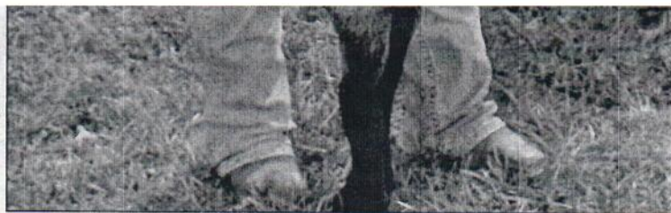
Sheep, above, and goat judging at th

RSVPs are required. Walk-ins are not guaranteed a spot. To register, contact the New Haven library at (573) 237-2189.