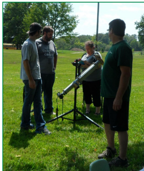
The New Haven branch had a telescope set-up for the public at the town's eclipse viewing event.