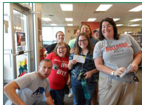
The St. Clair High School teachers' scavenger hunt was on August 15, and the St. Clair branch of the Scenic Regional Library was the final stop!