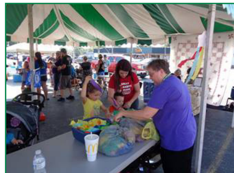
The Sullivan branch provided crafts and games for over 400 people at the Downtown Sullivan Block Party and Movie Night on August 19.

Saturday, September 30 at 2:00 pm Outdoor fun at the branch! Play games, win prizes!