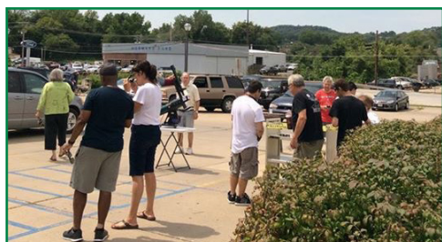
The Hermann branch had a viewing event in their parking lot, including a telescope set-up for the public.