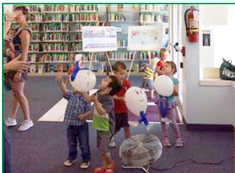
On August 17 at storytime in Pacific, the kids made the Man in the Moon with balloons and watched him dance up to the ceiling and back down again!