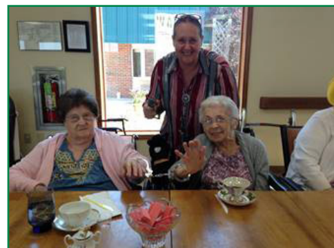
They had a rootin' tootin' good time at Gasconade manor in Owensville on August 18! A couple of the residents had to be handcuffed because they were too rowdy!! It was "Western Day" so all the cowboys & cowgirls enjoyed some western stories.

Homeschool Group 1st and 3rd Wednesday each month September 6: Solving a Rubik's Cube September 20: Big Games