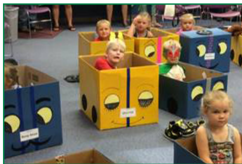
On August 2, kids at the Warrenton branch watched the movie "Cars" sitting inside their cardboard cars for Preschool Drive-In-Movie Night. A big Thank You to Warrenton 8 Cinema for providing the popcorn.