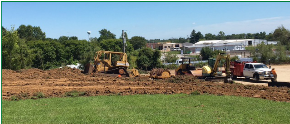
Construction on the new branch library in New Haven is underway.

Construction began on August 22 at the New Haven and Owensville locations. Wright Construction plans to utilize many of the same subcontractors for all seven locations. As a result, the beginning of each building project will be staggered. Wright Construction plans to have the foundations and flatwork complete at all seven locations by November 1 in order to avoid having to use winter concrete. All seven facilities are expected to be complete between June and August 2018.