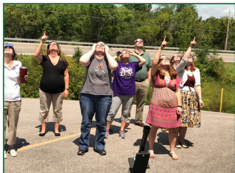
The library's administrative staff watch the eclipse from the parking lot. The library administration and all branches were closed from 1:00 to 1:30 PM for staff to view the once-in-a-lifetime event.

Library staff participated in eclipse viewing events throughout the district. Telescopes from the library's telescope loaner program were used for the events and several locations. The library also gave away 3,400 eclipse viewing glasses to the public throughout July.