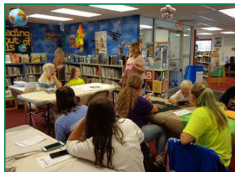
Teens were so privileged to have the Community Art Bus come and show them how to turn old t-shirts into recycled tote bags at the Sullivan branch on August 7.