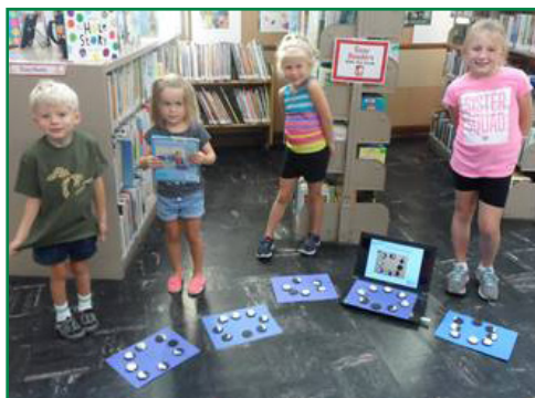
The kids at storytime in New Haven on August 15 made the moon phases out of Oreos.

**No Movie Night at the Library in September. We will resume in October.