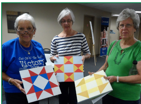
Everyone had a blast making these mini barn quilt plaques in Owensville August 18! Each patron was able to bring their craft home.