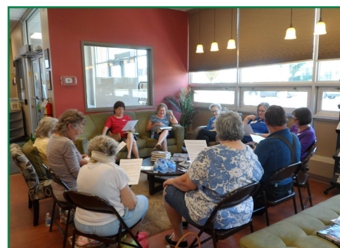
St. Clair Branch Book Club had a great discussion of the book Caught by Harlan Coben.