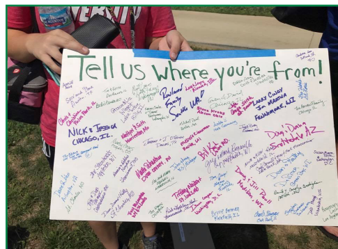
The Union Friends of the Library sold water at the Union viewing event at Veteran's Memorial Park. They asked visitors to sign their names and where they were from; people were from places as far away as Wisconsin, Los Angeles, Texas, and even Germany. The Union branch staff also set-up two telescopes at the park for the viewing event.