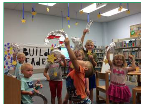
The stars came out at storytime in Hermann after the kids read about stars and space on August 3.