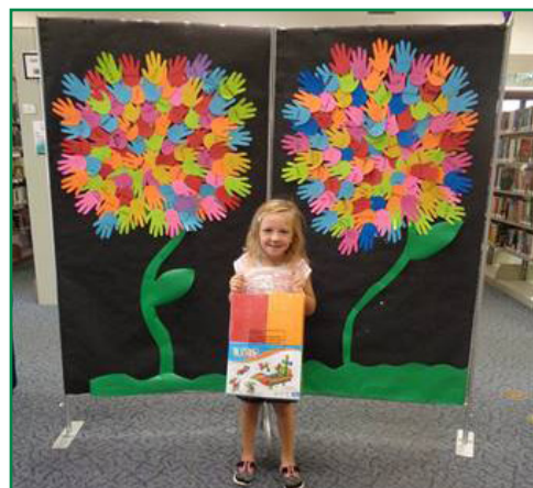
The Build a Better World Summer Reading Program is over. Here is one of the prize winners at the Union branch in front of flowers made of the handprints of all the kids who completed.