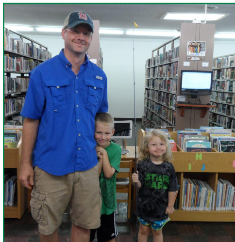
Patrons check out a fishing pole at the branch in Owensville as part of the library Rod and Reel Loaner program.

A monthly publication from your local library!