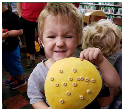
The kids at storytime in Owensville made moon craters with Cheerios on August 9.