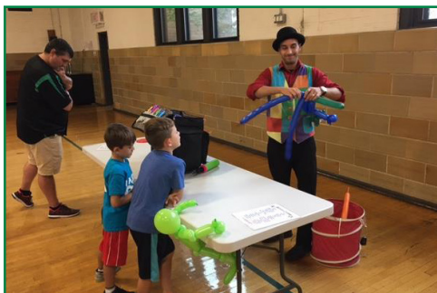
A balloon artist from Circus Kaput creates animals for children.