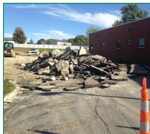
The parking lot in Warrenton is demolished on October 17 to make prepare the site for the addition.