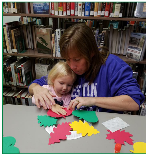
We had a fall-tastic good time at Owensville branch's storytime. The wreath craft was fun and easy and the kids loved listening to "10 Little Ninjas"!