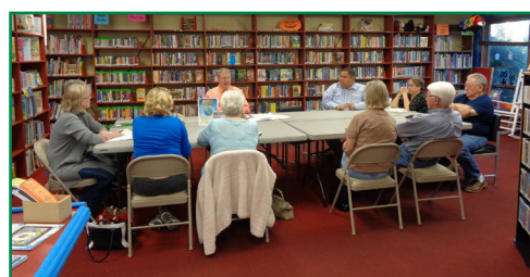
Sullivan had their first Friends of the Library meeting October 16, and had an excellent turn out with 8 members in attendance! They elected President, Vice President, Secretary, and Treasurer.

Drop in, play games, and maybe win a prize! Fun for everyone!