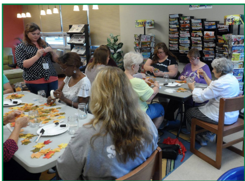
The St. Clair branch hosted a DIY: Mason Jar Maple Leaf Candle Holder event! Patrons were able to create decorative Autumn candle holders to take home.