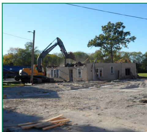
A building adjacent the branch in St. Clair was demolished on October 17 as construction begins at the site.

Photographs documenting the building project can be found at https://scenicregional.org/new-library-construction-photos . The webpage is updated daily.