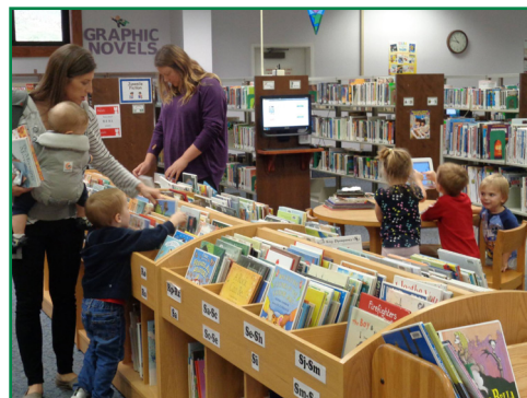
Kids enjoy finding their own books in our Easy Book bins at the Union branch.