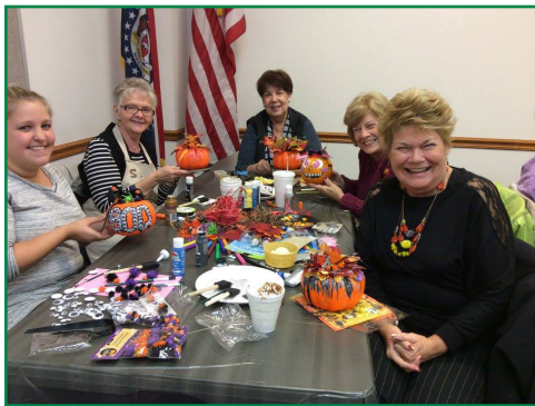
What a frightfully good time we had painting pumpkins at the Warren County branch! Guests got into the spirit with Halloween music, fall treats, and pumpkin-spiced hot chocolate!