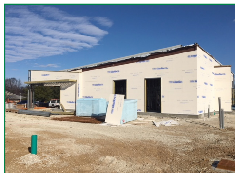
New Haven branch