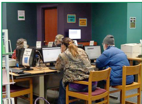
Patrons taking advantage of free Internet at the Union branch.