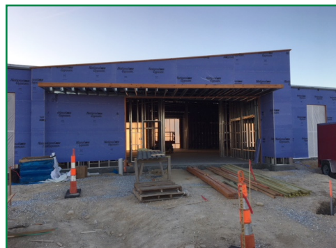
Wright City branch entrance.