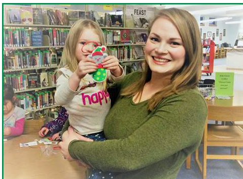
Annual Ornament Making at the Warrenton branch on December 14.