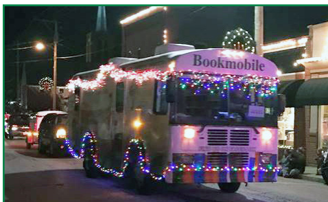
A good sized crowd braved the cold on December 8 to enjoy the annual Holiday Parade in Union.

Visit scenicregional.org/digital to begin using Zinio or any of the library's other digital products.