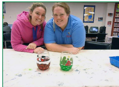
Glass painting was a hit at the Sullivan branch on December 5.