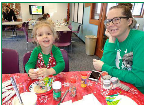
Families made ornaments and decorated cookies at the 15th Annual Ornament Making at Union branch.

A monthly publication from your local library!