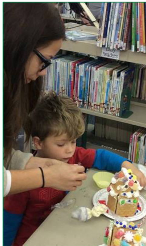
Kids and their caregivers made gingerbread houses during storytime at the Pacific branch.