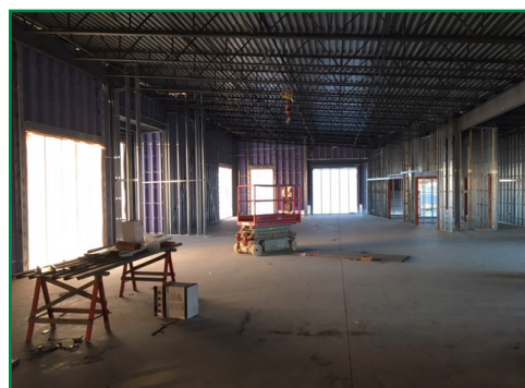
Interior of the Wright City branch.