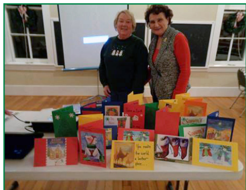
Patrons from the New Haven branch made cards for our troops on December 6.

Scenic Regional Library branches will be closed January 1 - 2, in observance of The New Year and January 15 for Martin Luther King, Jr. Day