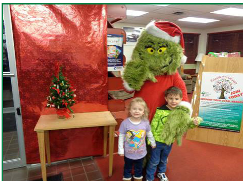
Kids at the Sullivan branch got to meet the Grinch on December 7.