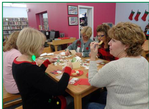
Patrons making Christmas cards during the Holiday Open House at the Pacific branch.