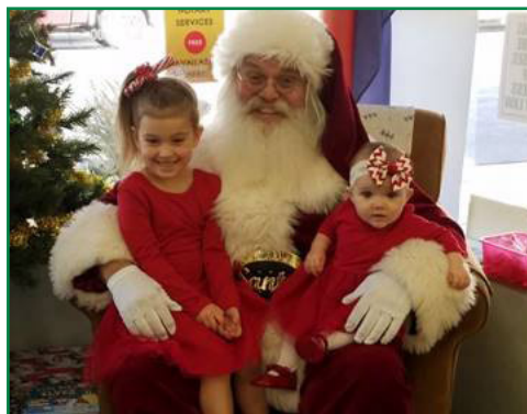
Santa visited the Owensville branch on December 16.