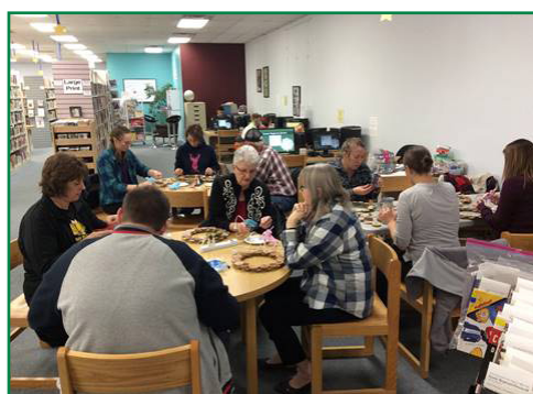
Patrons at the Hermann branch making Wood Slice Wreaths on December 7.