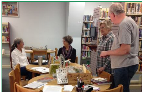
Hermann patrons visited to celebrate the Seed Library launch and get gardening questions answered.