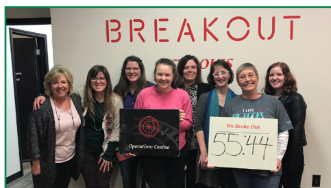
Scenic employees participated in a team-building exercise: Breakout Casino!