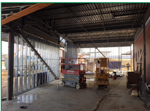
The Warrenton branch addition under construction.