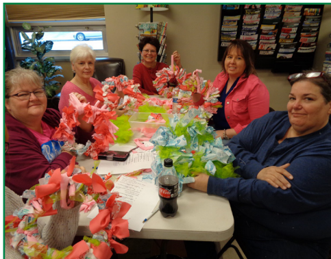
St. Clair patrons had a great time making No-Sew Fabric Wreaths. It was so neat to see how they all started with the same materials, but everyone's turned out different!