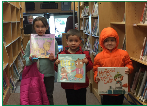
Three new little readers visited the Bookmobile and showed off their latest selections.