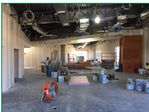
The Wright City branch under construction.