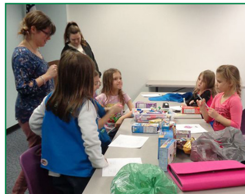
Union had an awesome Girl Scout Daisy Troop use the meeting room to make goodie bags for the on-site Little Free Pantry.

Saturday April 21 at 4:00 pm Design a tote bag to carry library books!