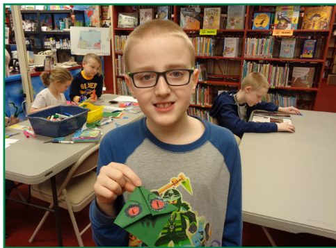
Young patrons made origami bookmarks during Kids Club at the Sullivan branch.

A monthly publication from your local library!