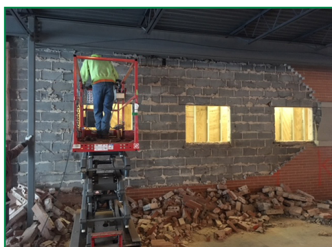
The wall between the existing St. Clair branch and the addition being demolished.

Cord Moving and Storage, located in Earth City, will move the library's materials from the old branches to the new buildings. The company has moved all Scenic Regional Library branches since 1991, beginning with the Union branch when it moved from downtown to its existing location.