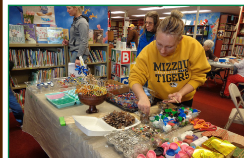
Sullivan patrons used all kinds of recycled items to create plant buddies to take home.