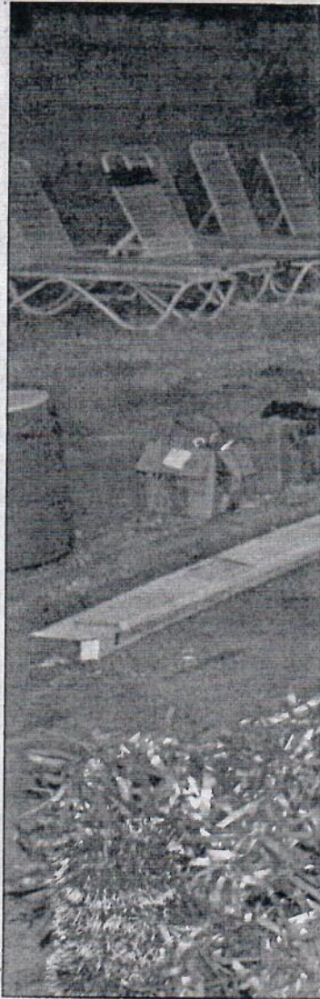
OLD CHRISTMAS DE Works garage sale Saturd