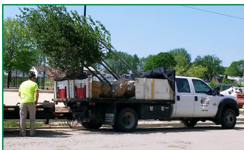
Several trees were planted at the new Owensville branch May 9! The branch opened on May 23.