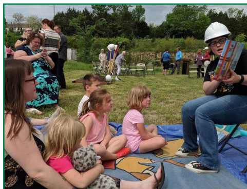
Family members enjoyed a construction-themed storytime during the Union Groundbreaking at the location of the future Union branch.

What is your favorite book? Love You Forever by Robert Munsch.