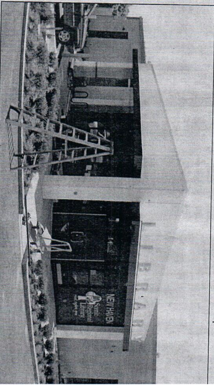
FINISHING TOUCHES were underway at the library last week as it prepared for a May

"It appears that the leaks have been fixed," he said. "I've not lost any water out of it. I think it's in good shape for the season here." The cost of the repair had feared That v ey for a tube. Fo years, th caulked a keep it temporary Contin