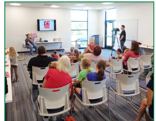
Sullivan had an awesome storytime in their new library! We read about music and sang about our sillies while playing musical instruments!