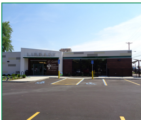
A view of the new parking lot. The spaces available have increased from 21 to 38 spaces.