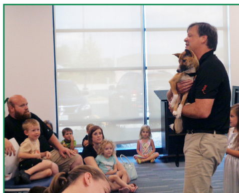
Animal Tales came to all 9 branches to present Born to Be Wild Rock'n Animals. Each animal showcased a unique vocal ability; perfect for our "Libraries Rock" Summer Reading Program theme!