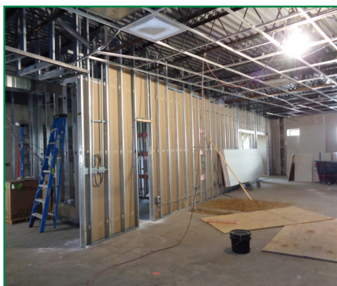
Renovations are underway for the original side of the St. Clair branch.

A grand opening event for the new library is scheduled for Saturday, September 22.