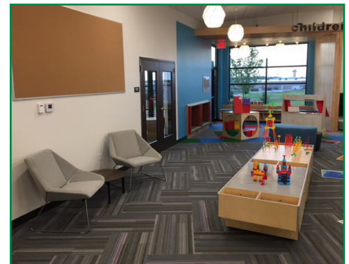
Activity tables in the children's area.