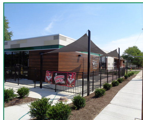
Two outside patios with shade structures. Outdoor seating will be available for patrons to enjoy.