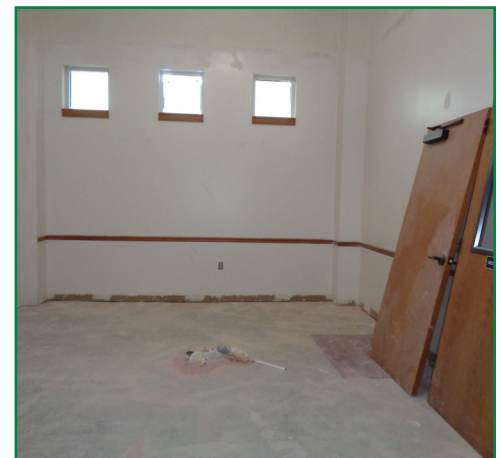
Future study room. The branch will have two study rooms available for patrons to reserve.