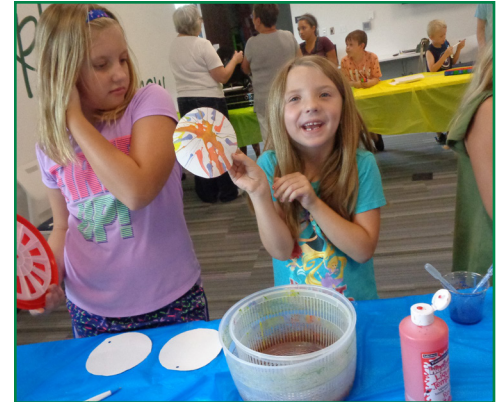
Art took a cool spin with the New Haven Kid's Club on July 19. Children created art with salad spinners and a record turntable.