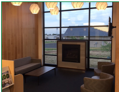
Adult seating area.