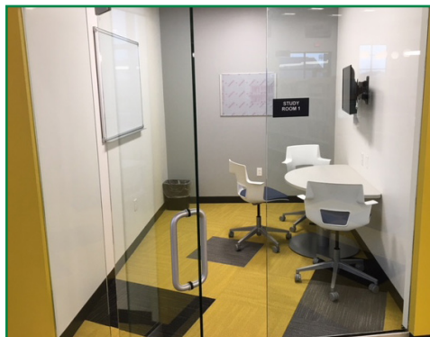
Study room 1.