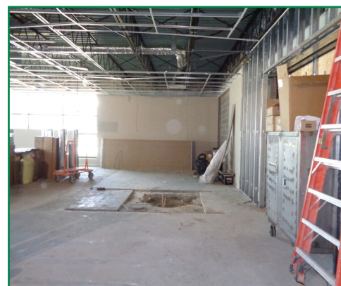
New spaces dedicated for Teens, Adults, and Children will be available in the newly renovated library.