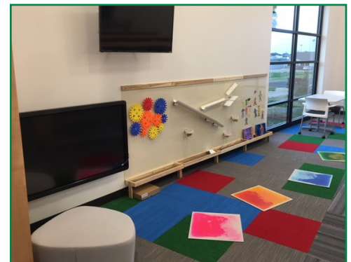
Magnet wall and giant touch-screen tablet in the children's area.