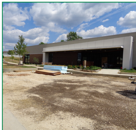
Construction is still in process for the main entrance of the Warrenton branch.

A grand opening event for the new library is tentatively scheduled for Saturday, October 20, from 11:00 AM to 1:00 PM. The event will have music, along with free hot dogs, chips, drinks, and popcorn. There will also be free children's activities, including air brush tattoos, children's carnival games, a bounce house, and a balloon artist. A short dedication ceremony will take place at the grand opening event.