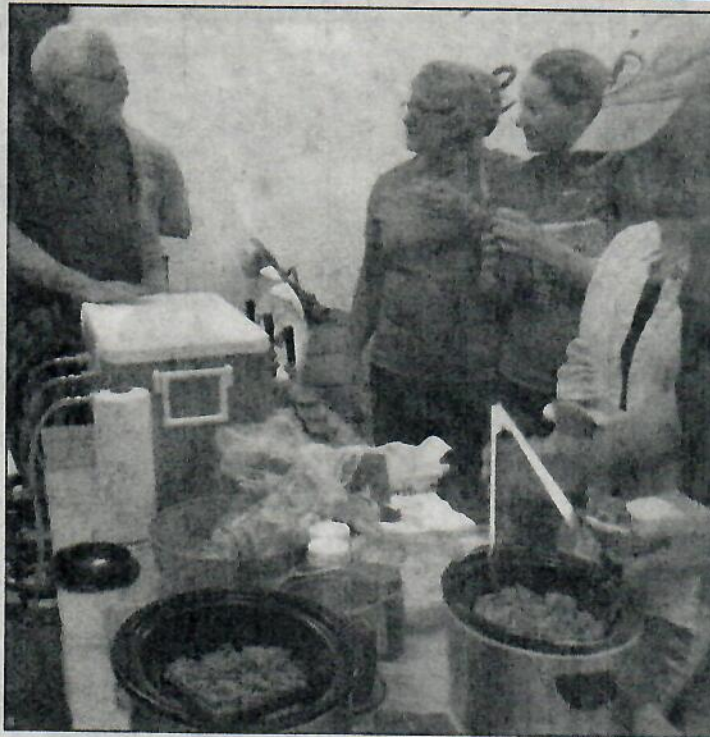
BREWS & BARBECUE attendees sample some of each following the presentation Thursday night at the Scenic Regional Library in New Haven.