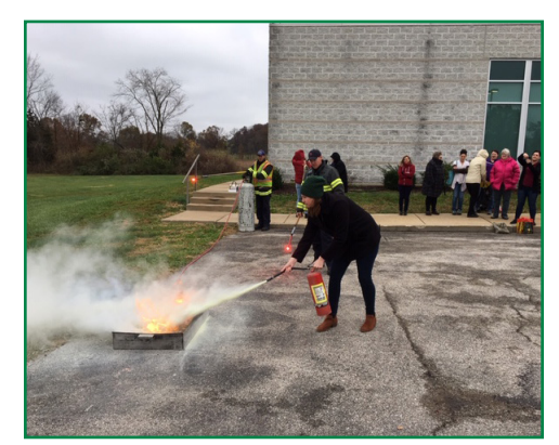
The Union Fire Protection District provided fire extinguisher training.