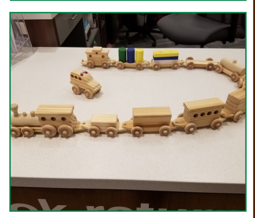
Warrenton patron built and donated a wooden train set to the library. The train set has been placed in the children's section, along with other trains, at the activity tables.