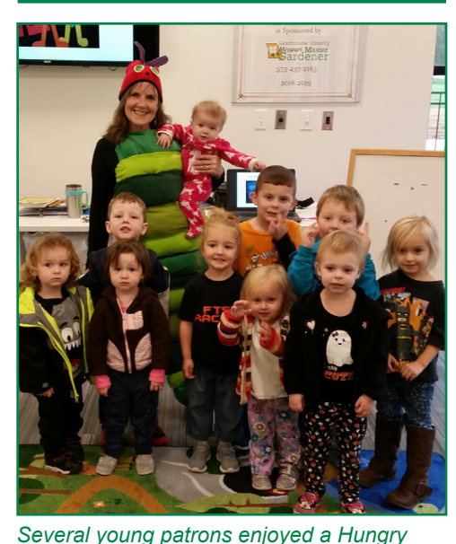
Caterpillar Themed storytime in Owensville.

The Pacific and Sullivan Friends of the Library groups donated identical displays to their branches in October.