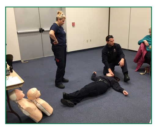
Union Ambulance District provided a session on first aid.

\mathrm{T} he library was closed at all locations to hold its fourth annual staff development day at the East Central College Training Center on Friday, November 9. The library had approximately 65 staff attend the event, in addition to staff from the De Soto Public Library and Festus Public Library. Sessions included situational awareness, first aid, basic yoga, teen programming, and mandatory child abuse reporting.