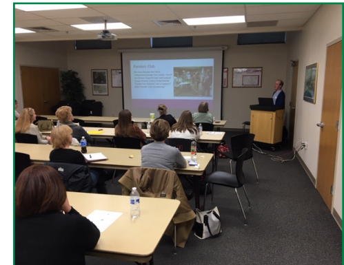
Library staff attend a session on teen and tween programming.