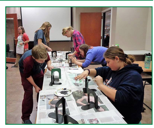
Our teens in Union painted bookends on November 8. Each teen was able to take home two sets for their home library. There was so much creativity in one room!