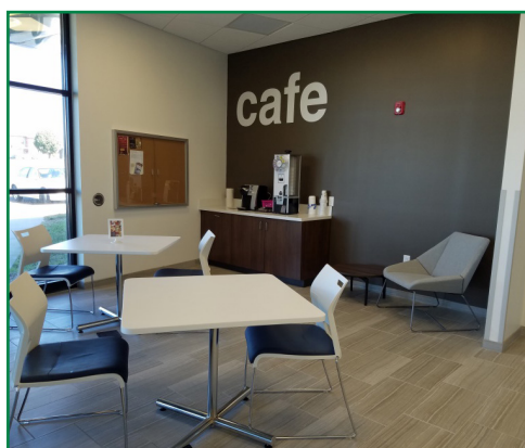
Warrenton branch café area.

November 9: Staff Development Day & November 22-23: Thanksgiving