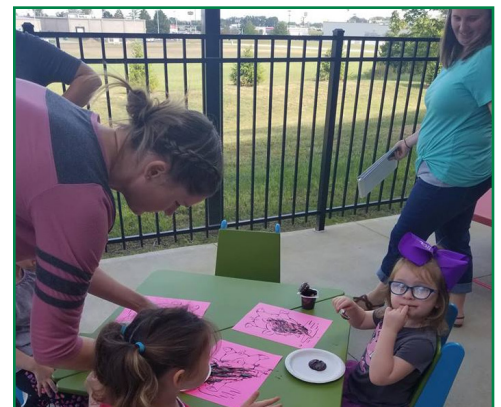
Families in storytime at the Sullivan branch enjoyed painting their muddy pigs out on the patio.