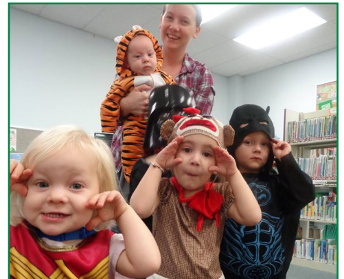
Costume fun at Hermann branch Storytime where they played a spooky spider game and read books about carrots and peas.