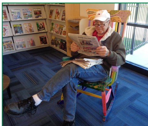
A patron in St. Clair enjoying the rocking chair after it was awarded at the Staff Appreciation Banquet.