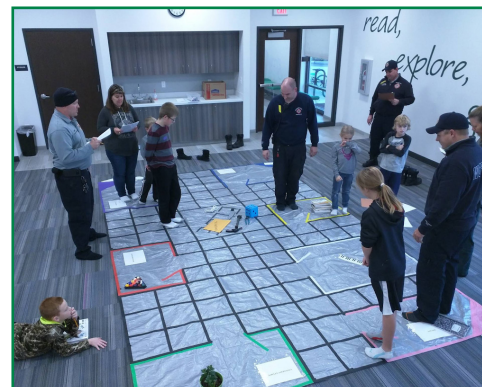
Families and firefighters playing life-size Clue at the Wright City branch.