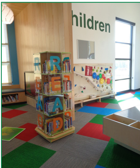
Sullivan board book display.