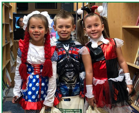
Trick-or-treaters on the bookmobile, with bags of books. What a treat!