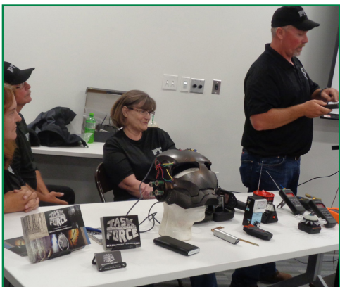
The Paranormal Task Force presented at the Pacific branch on October 11 to a packed house!