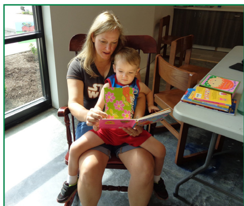
Rock-a-thon participants at the St. Clair branch.