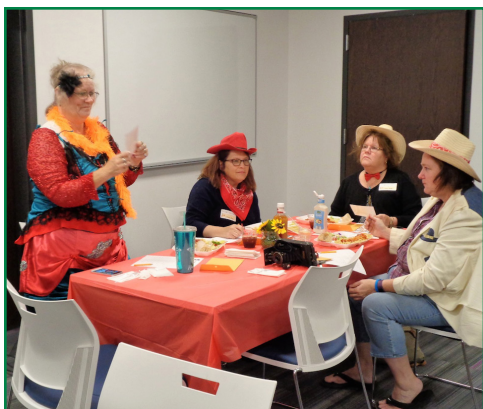
Patrons at the St. Clair branch had a rootin' tootin' good time at the Wild West Murder Mystery Dinner.