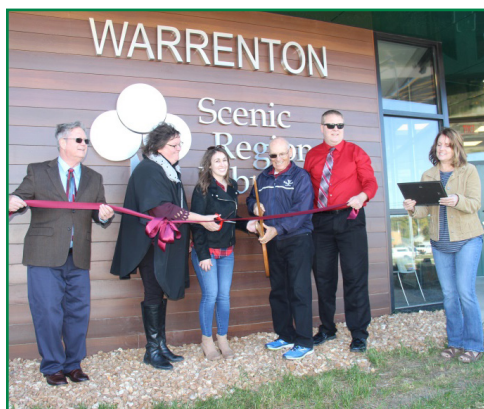
Ribbon-cutting at the Warrenton branch grand opening event.