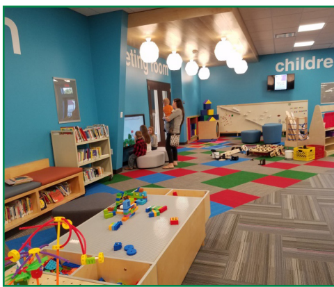
Warrenton branch children's area.