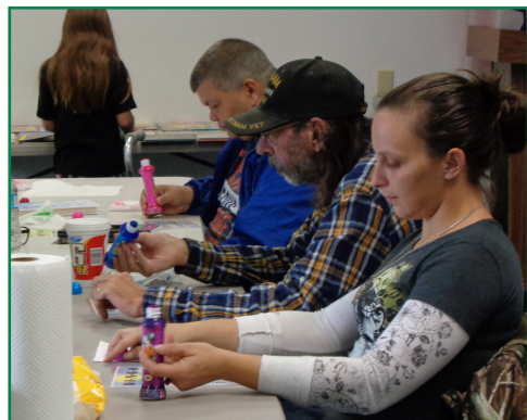
Book Bingo at the Union branch happens the 4th Thursday of every month at 11am. Come out and win some books!