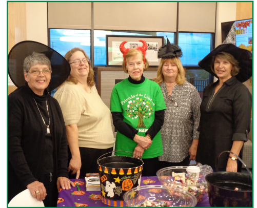
The New Haven Friends of the Library helped out with Boo-a-pa-looza! They handed out books and treats to the kids.