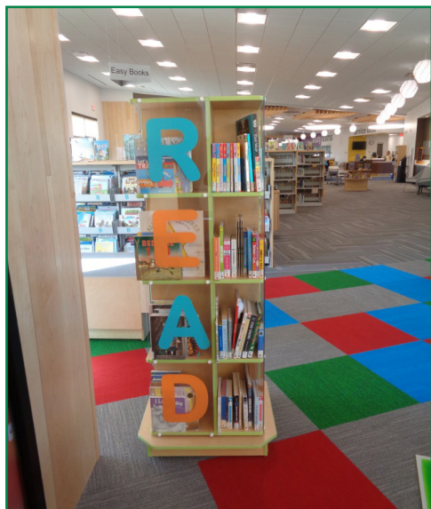
Pacific board book display.

The Pacific and Sullivan Friends of the Library groups each purchased a large-capacity display for the children's area of their branch to shelve their board books. While some of the board books are shelved beneath padded benches in the children's areas, neither branch has enough space for their entire collection. The displays were delivered to the branch in late October. Each display is 2' by 2' by 4-1/2' and cost approximately $1,000, including shipping.