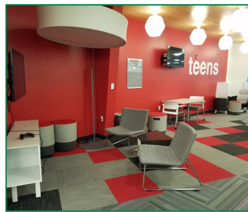
Warrenton branch teen area.