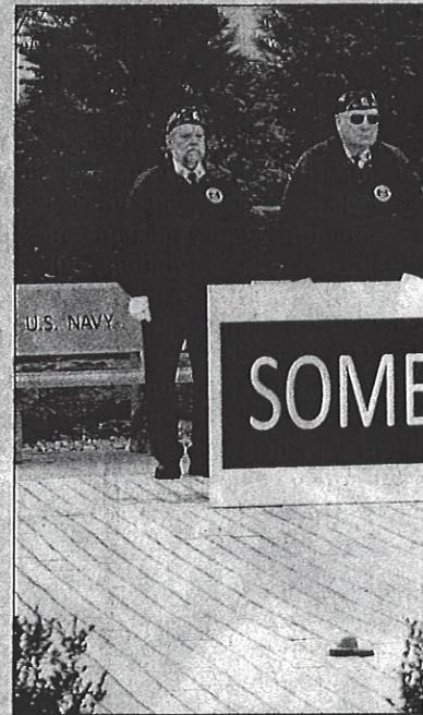
STANDING IN HONOR — Member wall at the Tribute to Veterans Memorial ceremony in November. See memorial site for the first time du