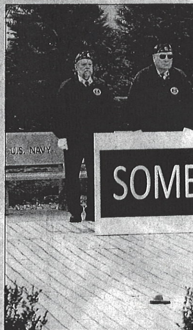
STANDING IN HONOR — Member wall at the Tribute to Veterans Memorial ceremony in November. See memorial site for the first time du