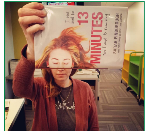
Teens participated in a scavenger hunt at the Wright City branch including a #bookface challenge.