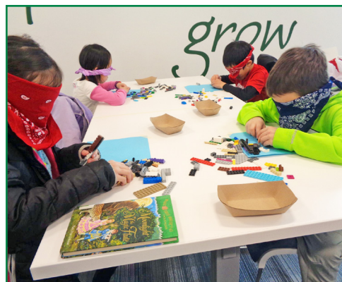
Can you build blindfolded? Kids at the Building Block Challenge in New Haven were finding out.