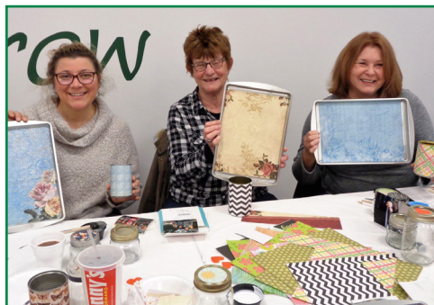
Patrons crafting their winter blues away at the Warrenton branch.