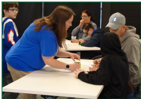
Kids at the St. Clair branch learning to solve a Rubik's Cube.