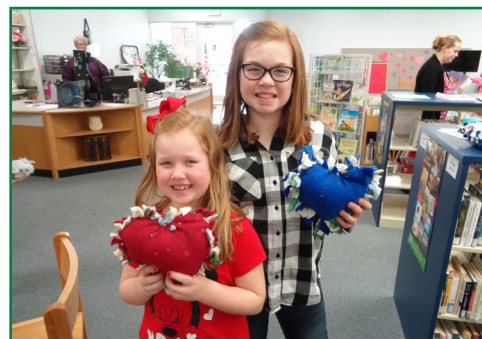
Kids in Hermann made no-sew pillows for Valentine's Day at Kids Club.