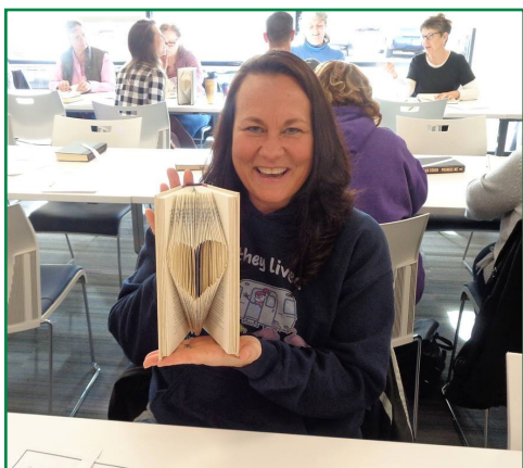
This patron in St. Clair really loves the book art she made during the recent Folded Book Art program.