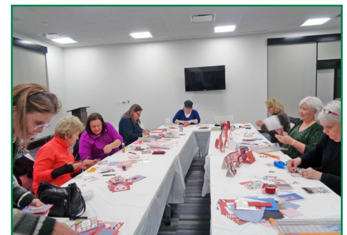
Our wonderful patrons in Pacific made over 100 Valentines to send out to local homebound Vets.