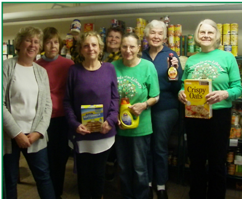
Several members of the New Haven Friends of the Library volunteered at the New Haven Food Pantry in February. Early in the month they sponsored a food drive at the library, collecting over 150 cleaning and non-perishable food items.

A monthly publication from your local library!