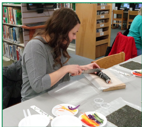
Patrons in Hermann learning to make sushi!