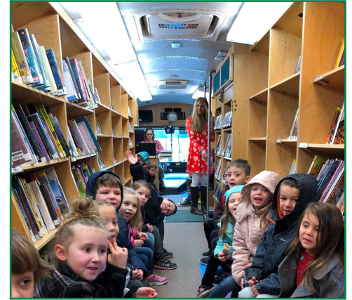
Kids really love hanging out on the bookmobile!