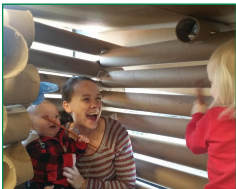
What a fun way to celebrate President's Day! Kids in Owensville built log cabins with Lincoln Logs, cardboard tubes, and even graham crackers and pretzels.

A monthly publication from your local library!