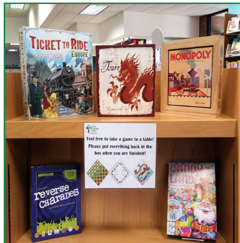
Games are now available to play in all of our branches. Here are the games at the Union branch.