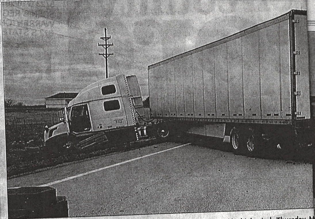
TRUCK PUSHED BY WIND — At least one vehicle accident was caused by high winds Thursday, March 21. A fire department official described the wind picking up his vehicle and throwing it from the road.