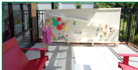
The New Haven activity board was visited by a young patron.