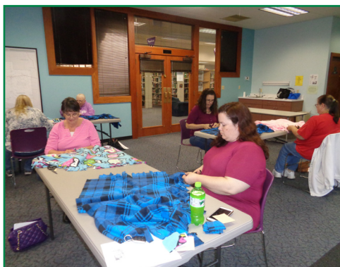
Union patrons participated in the "Linus Blanket" program at the branch. You all are going to help brighten a child's day!

A monthly publication from your local library!