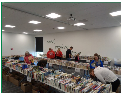
Warrenton branch book sale.