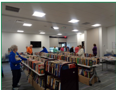
Pacific branch book sale.

Is there anything else you would like people to know about you, your job, or your library branch? Like I said, total sci-fi/fantasy geek here and if anybody ever wants recommendations on books, tv shows, and movies, I'm your human. Live long and prosper!