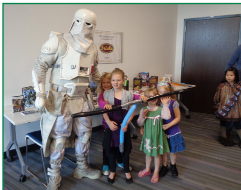
"May the Fourth Be With You" was celebrated in Sullivan with Star Wars-themed activities and guests.