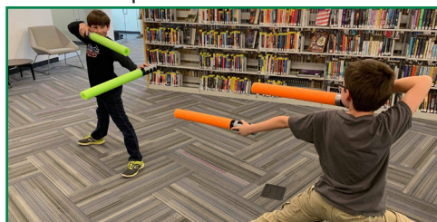
Pool Noodle light sabers! Guests enjoyed various Jedi training activities in St. Clair.

Thursday, June 27 at 5:00 pm RSVP required.