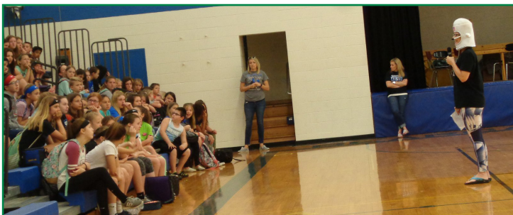
Hermann's Childrens Programmer visited all of the Hermann schools and talked about the Summer Reading Program and all the exciting events planned for everyone.