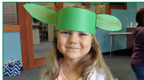
Union storytime had a Star Wars theme in May. Young patrons made Yoda hats afterward.

Monday, June 3 at 6:00 pm A starship digital game.