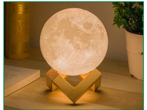
A moon lamp is one of this year's drawing prizes for the adult summer reading program.

More information, including upcoming adult programs can be found here at https://scenicregional.org/asrc/ .