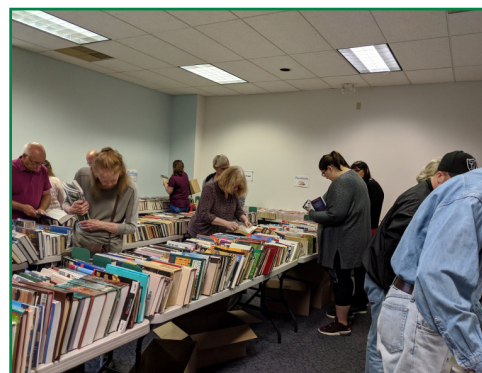
Union branch book sale.