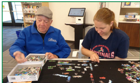
Patrons in Pacific enjoyed building a puzzle together at the branch.

Friday, June 14 at 7:00 pm "A Dog's Way Home" Saturday, June 15 at 7:00 pm "Instant Family"