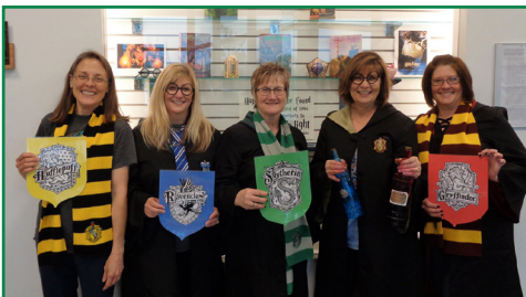
Warrenton employees dressed up for a Harry Potter themed program at the branch.

Thursday, June 13 at 7:30 pm FREE telescope training and night sky viewing. Please RSVP.