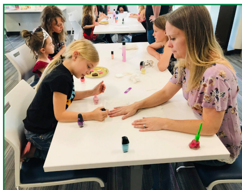
"Mommy & Me Manicures" was a hit in Wright City. Several families were able to come enjoy time together.