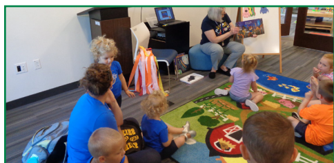
New Haven Storytime took a trip in a rocket ship to the moon! 5,4,3,2,1.... Blast off!

Teen Movie: "Guardians of the Galaxy" Saturday, July 27 at 1:00 pm Movie and snacks!