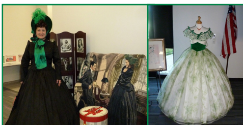
Gone with the Wind 80th Anniversary Week was celebrated at the Warrenton branch, featuring costumes from the epic film!