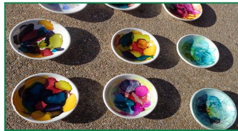
Thanks to all who came out to make "Galaxy Alcohol Ink Jewelry Dishes" in Union. Beautiful!