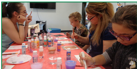
The New Haven Teen Scene was all about creating paintings of the galaxy.

Wednesday, July 17 at 6:00 pm Please register.