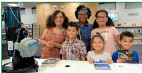
This family was excited to check out a telescope from our Warrenton branch.