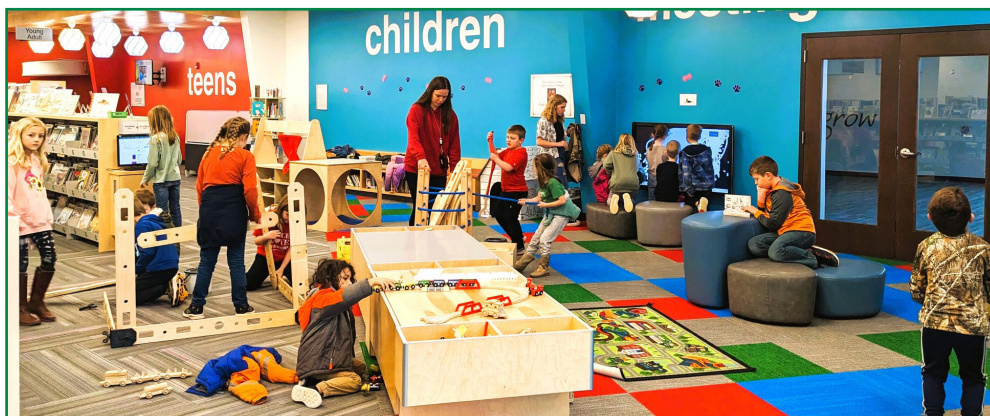
Wesleyan Kiddie Kollege kiddos took a walk to the Warrenton branch and enjoyed building with the Rigamajig, playing with the Clevertouch, trains and Lego.