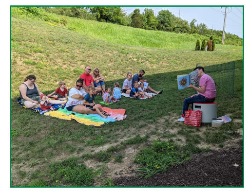
Outdoor storytime at the Union branch on July 14.