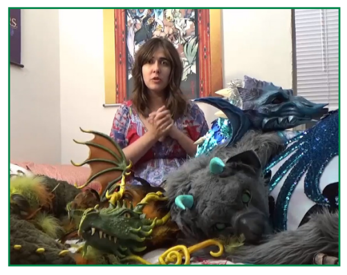
St. Louis Fantasy Puppetry visited with us virtually and read to our young patrons with the help of her dragon friends.