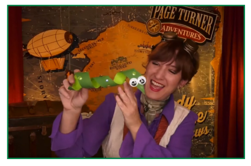
Our friends at Page Turner taught young patrons how to make a fun snake craft.

Franklin County: 636-789-2686 www.jfcac.org Warren County: 636-946-5600 www.youthinneed.org Gasconade County 573-437-3332 http://mocaonline.org