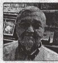
New Haven News