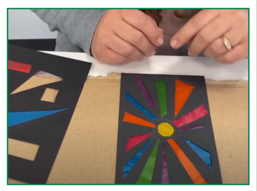
Using cardstock and cellophane sheets provided at all branches, kids were able to make their own stained class windows.