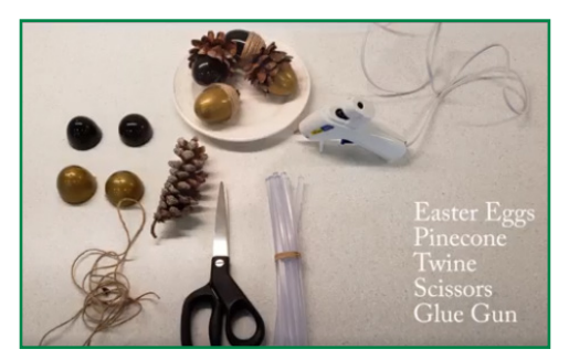
Patrons had the opportunity to follow a virtual step-by-step project to learn to make acorns from Dollar Store items.