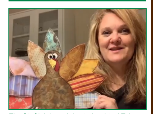
The St. Clair branch hosted a virtual Take & Make Turkey Craft just in time for the Thanksgiving holiday.

Due to the dramatic increases in new COVID cases and the testing positivity rate in the area, the library paused passport services, notary service, and take-a-ticket training (one-on-one computer help) beginning November 17, until further notice. The library administration made the decision with the belief that the close proximity between staff and patrons required to perform the services poses an unnecessary health risk to those involved.