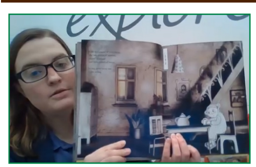
Virtual Pajama Storytime in Union's theme was Compassion for Others.

After reading 1,000 books, a child will receive a "color-your-own" bookbag that they can decorate to proudly carry their library books. The parent and child will also be featured in the library's newsletter and social media pages. Best of all, they will feel the pride of accomplishment of reaching this goal together.