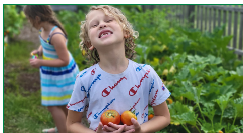
Many young patrons enjoyed the Community Garden during the 2023 growing season.