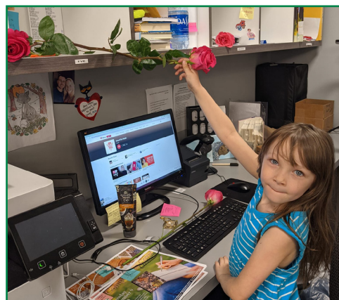
Girl Scout Troop 130 handed out roses to the staff at our Wright City branch because they appreciate us!