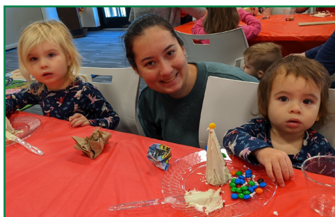
In addition to hearing some stories at storytime, our little youngest Sullivan patrons made a Christmas tree snack.