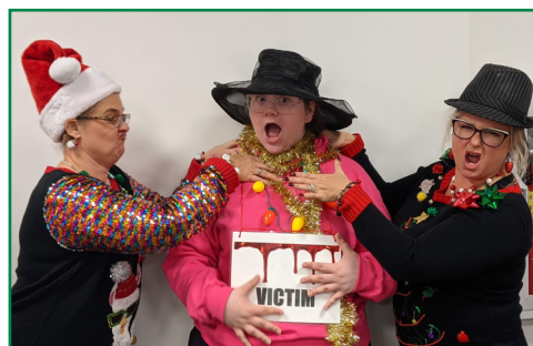
Had such a great time solving the Murder at the Ugly Christmas Sweater Party at our Pacific branch!