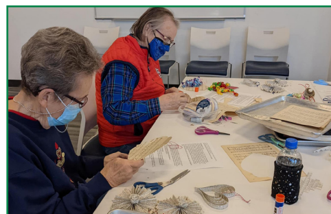
Upcycling old book pages was great fun for this group of ladies in Owensville.