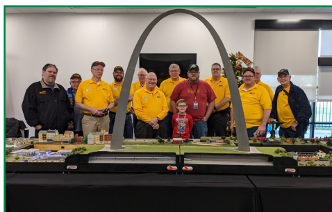
Mississippi Valley N-Scalers created a joyous scene at our Pacific branch to enjoy!