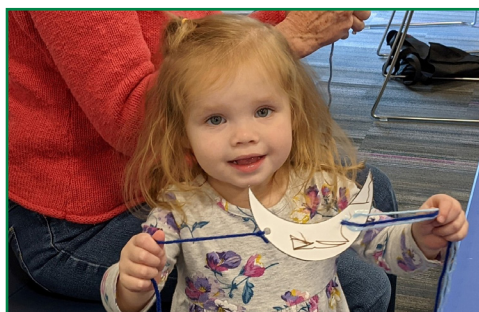
Storytime moons and stars in New Haven.