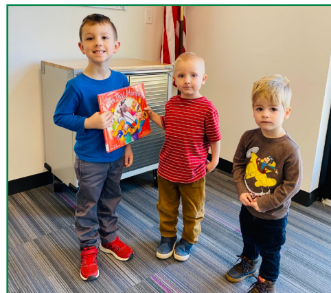
Kids all across Missouri have been voting for their favorite picture books for the Building Block Award. These kids in St. Clair are sure proud of their vote!