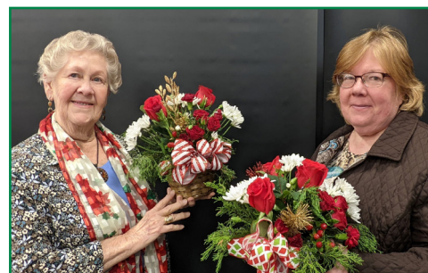
A Moment of Grace Florist came to the Warrenton branch for a fun evening of Christmas flower arranging!

After school drop-in programs for teens in the meeting room.