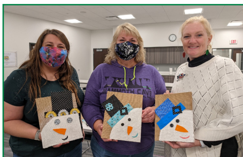
Ladies in Pacific fashioned a one-of-a-kind snowman using various supplies and talent.