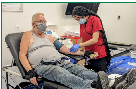
The Blood Drive at our Union branch was a huge success.