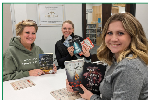
The Pacific branch hosted their monthly Bingo Night and gave away books as prizes!

LIKE US! GO TO FACEBOOK.COM | VISIT US AT SCENICREGIONAL.ORG