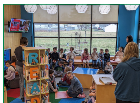
Students and staff from Gerald Elementary took a tour of the Owensville branch.

Mark your calendars! Scenic Regional Library's spring book sale will soon be returning! From Thursday, May 16 to Saturday, May 18, join us at all nine locations and shop thousands of adult and children's books, CDs, and audiobooks. Book sale volunteers earn a $5 voucher for sale books for each hour they help. A special preview for Friends of the Library members will be on Wednesday, May 15, from 5 pm to 6 pm. All Friends of the Library receive a 10% discount at the book sale and may attend the preview event.