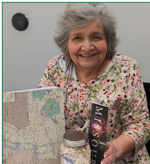
Warrenton branch patrons had a fun evening making crafts using old maps and stamps.