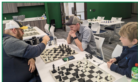
A chess expert came to the Hermann branch to teach strategy during Chess Club.